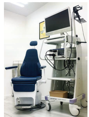
耳鼻喉內窺鏡專科儀器 Nasal endoscopy machine