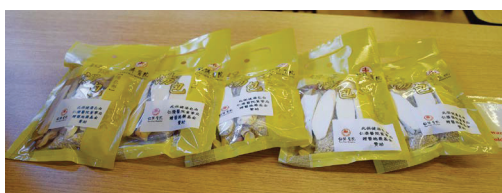
免費派贈中醫保健湯包予有需要人士 Complementary herbal soup packs for the needy

本年度曾接受本院贈醫或贈醫施藥優惠的人次超過四萬；免費派贈的中醫保健湯包接近一萬包。