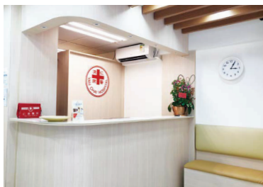
仁濟醫院綜合醫療中心 Yan Chai Hospital Integrated Medical Centre

Our centre jointly organized the health programme with Christian Family Service Centre, to provide free Chinese medicine and dental service to the less -privileged group in Sham Shui Po Area. The free medical voucher had been distributed to those in need during August to October 2021, around 200 citizens was benefited from this programme.