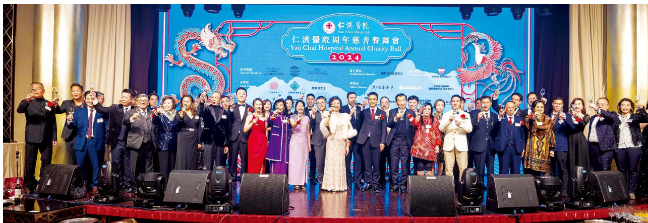
一眾董事局成員及貴賓於台上祝酒，祝賀活動圓滿成功 Board Members and VIP guests made a toast on the stage for the success of the event