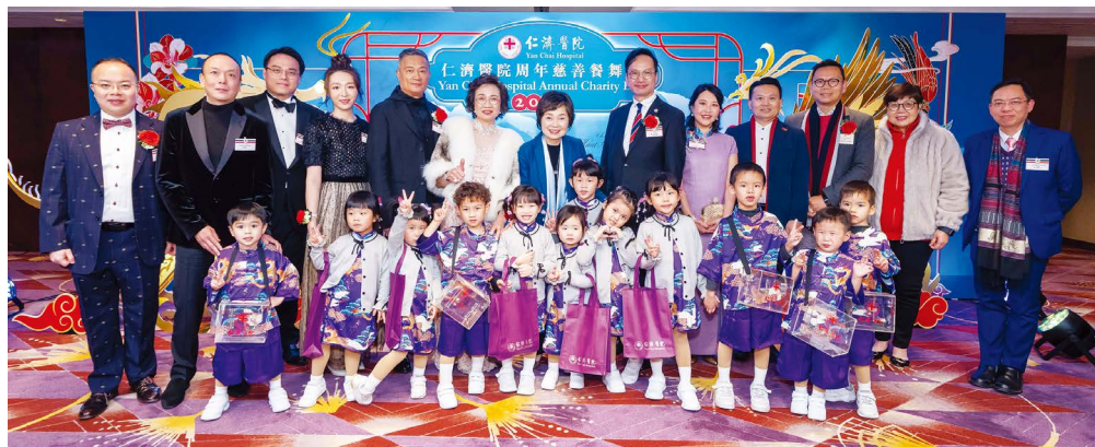
主禮嘉賓(中)與董事局成員及本院董伯英幼稚園/幼兒中心小朋友合照留念 Group photo of the Guest of Honour, Board Members and the pupils of Yan Chai Hospital Tung Pak Ying Kindergarten/Child Care Centre