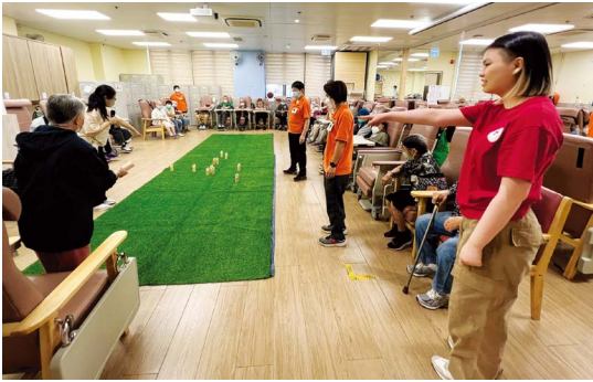
與一眾老友記學習新興運動「芬蘭木棋」，訓練他們肌肉及手眼協調 The Transworld Committee were learning a new emerging sport called "Molky" with elders to build up their muscles and hand-eye coordination