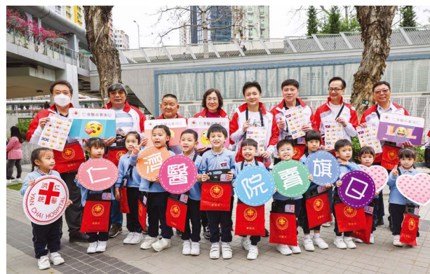
院屬蔡百泰幼稚園/幼兒中心的學生也參與賣旗活動 Students of Yan Chai Hospital Choi Pat Tai Kindergarten/Child Care Centre joined the Flag Day happily