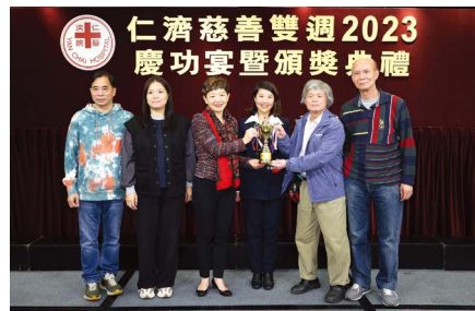
總第八名：荃昌中心昌安大廈業主立案法團/荃昌中心荃灣昌寧大廈業主立案法團 The 7 th runner-up: Owners' Corporation of Cheong On Building Tsuen Cheong Centre / Owners' Corporation of Cheong Ning Building Tsuen Cheong Centre