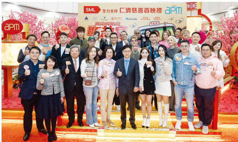
一眾嘉賓與導演及演員預祝電影票房大賣 Guests and actors wished the best of movie sales