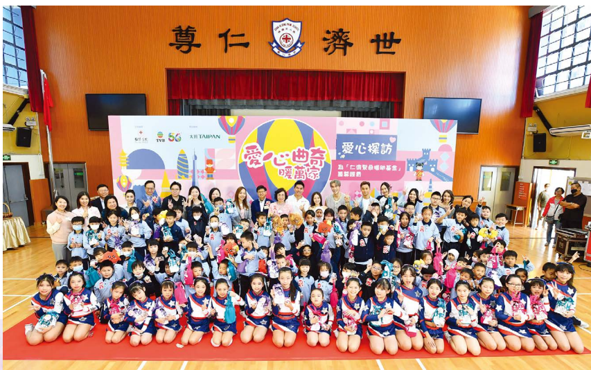
董事局成員陪同藝員嘉賓探訪仁濟醫院陳耀星小學，與小朋友大玩遊戲及送贈愛心曲奇 Board Members, guests and artistes visited Yan Chai Hospital Chan Lu Sing Primary School and presented charity cookies as gifts to the students