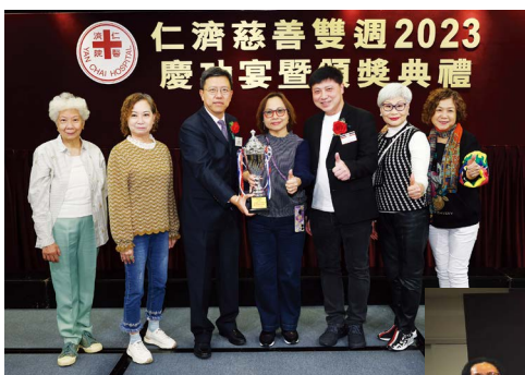
慈善獎券最高銷售亞軍：大埔愛心籌委會 1 st runner-up: Tai Po Love Organizing Committee