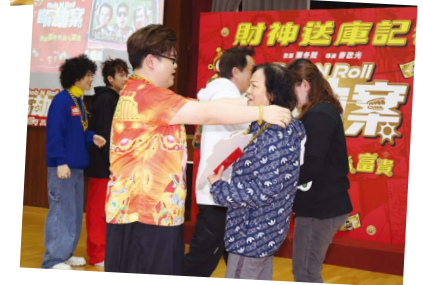
一眾演員們投入與本院屬下學生及長者們玩遊戲 Actors played games with students and elders from Yan Chai units