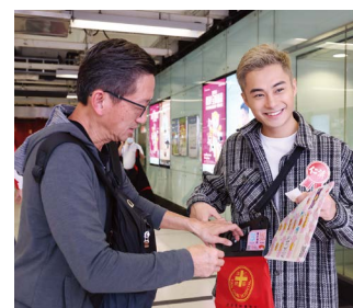
藝人宋宛穎、王菲及孔德賢為善不甘後人，於街道上積極賣旗 Artists Sabina MENDOS, Fei WONG and Danny HUNG sold flags on the street