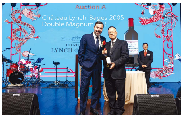
Château Lynch-Bages 2005 Double Magnum (3公升/3L) 捐贈者: Château Lynch-Bages Donor: Château Lynch-Bages 承投者: 張偉球先生MH太平紳士 Auction Winner: Mr. CHEUNG Wai-kou, Lawrence, MH, JP