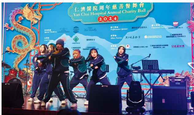
本院靚次伯紀念中學同學們特別送上充滿活力的街舞表演 Students of Yan Chai Hospital Lan Chi Pak Memorial Secondary School presented a special street dance performance