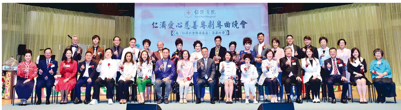
一眾表演嘉賓與主禮嘉賓及董事局成員合照 Board Members accompanied the Guest of Honour took a group photo with performers