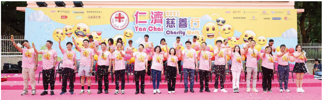
花炮一響，象徵慈善行正式起步 After the "Pop" of firework guns, Charity Walk started