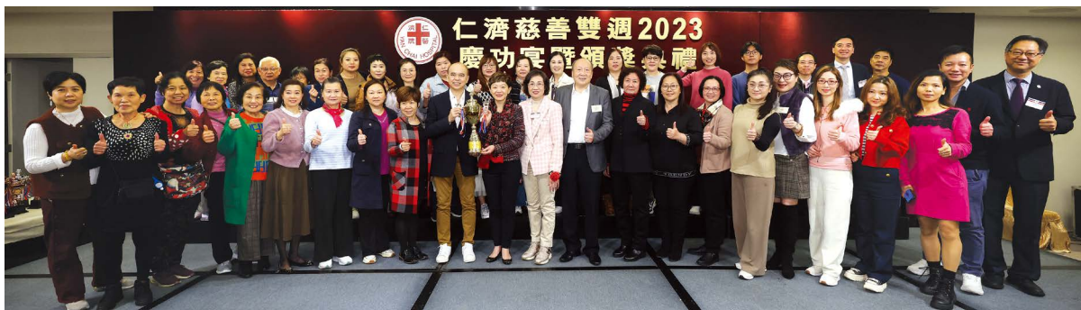
總冠軍：將軍澳各界 Champion: Tseung Kwan O Community