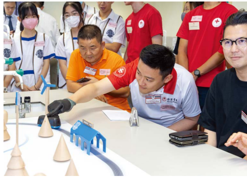
董事局成員及學生會成員在仁濟醫院第二中學師生帶領下，一同體驗STEM的科學實驗 Board Members and the Transworld Committee participated in the STEM experiments under the instruction of teachers and students from Yan Chai Hospital No. 2 Secondary School