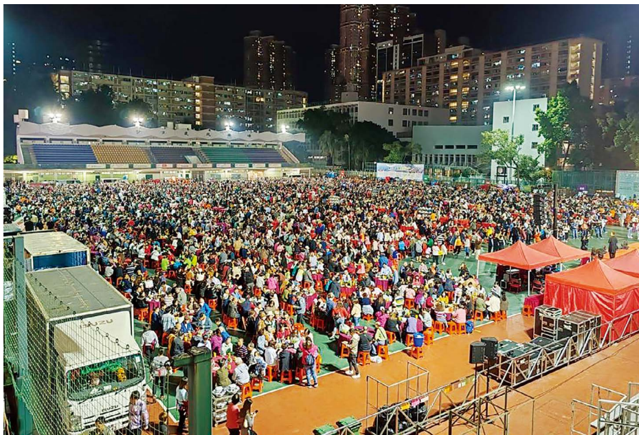
超過6,500名善長齊聚荃灣，享用盆菜 Over 6,500 donors gathered in Tsuen Wan to have Poon Choi together