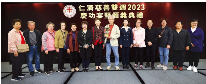
總第七名：長青和諧協會 The 6 th runner-up: Cheung Ching Harmony Association