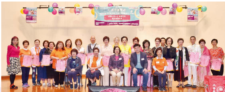
青康賢毅社慈善卡拉OK熱唱日及綜合歌唱表演 Ching Hong Yin Ngai Society singing concert