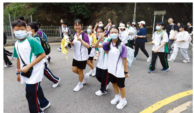
慈善行吸引男女老幼一同參與 Charity walk attracted the participation of all ages