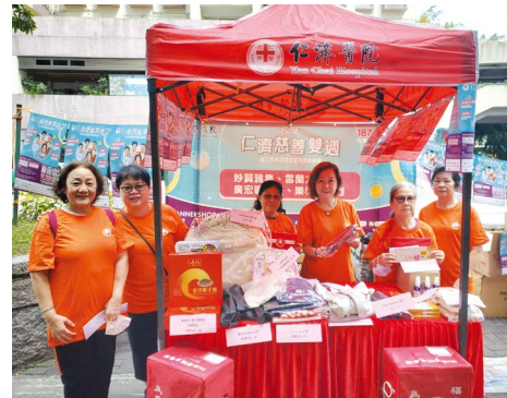
義工們於街頭募捐及義賣 Volunteers contributed to street fundraising and charity sale