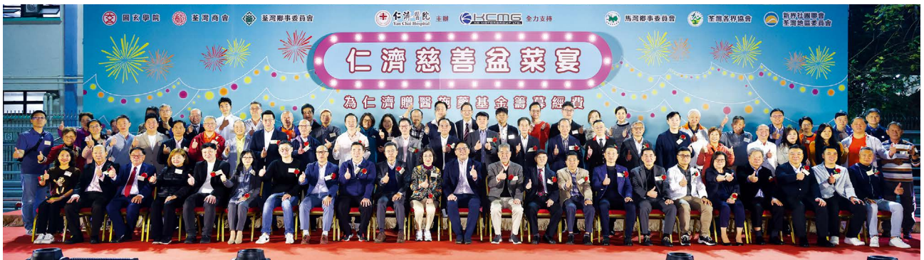
主禮嘉賓與活動籌備委員會成員、政府官員、贊助商及一眾嘉賓出席支持 Group photo of Guest of Honour, Function Committee Members, government officials, sponsors and other guests attended to support the event