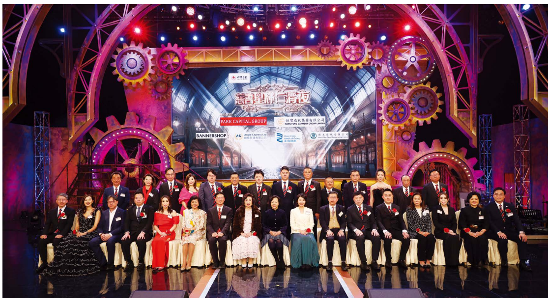
一眾董事局及顧問局成員合照 Group photo of Board and Advisory Board Members