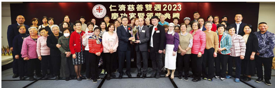
慈善獎券最高銷售冠軍：香港神慈秀明會 The Champion of the Top Sales of Yan Chai Charity Raffle Tickets: Shinji Shumeikai of Hong Kong Ltd.