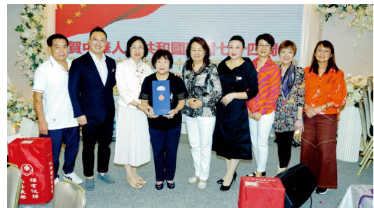
香港創樂和諧協會籌款晚宴 Hong Kong Chong Lok Wo Hia Association Charity Dinner