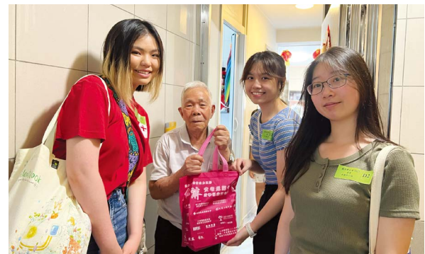
前往葵芳邨送贈愛心福袋予獨居長者，帶給他們溫暖及關懷 Sharing their warmth and care to the elders living in Kwai Fong Estate by delivering the fortune bags