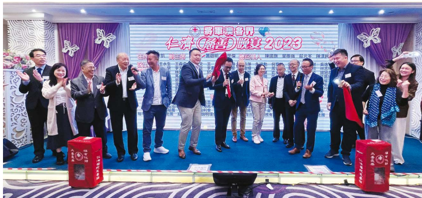
將軍澳各界籌款晚宴 Tseung Kwan O Community Charity Dinner