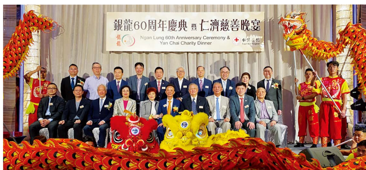
出席嘉賓與金龍及醒獅大合照，寓意集團大展鴻圖、善款節節上升 Guests took a group photo with the golden dragons and lions which symbolized the group business growing with success and a wish for raising more fund for Yan Chai