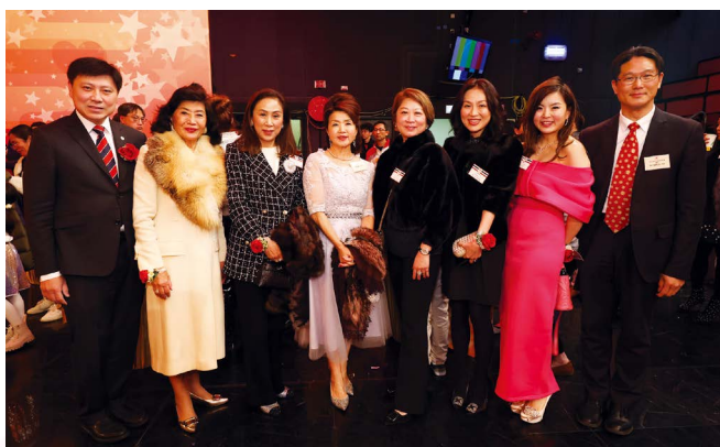
董事局及顧問局成員出席支持，並與嘉賓合照留念 Board and Advisory Board Members attended to support and took group photos with guests