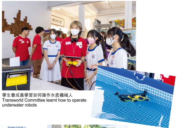
學生會成員學習如何操作水底機械人 Transworld Committee learnt how to operate underwater robots