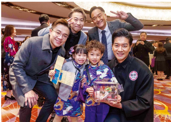
本院董伯英幼稚園/幼兒中心小朋友向在場賓客勸銷獎券 Pupils of Yan Chai Hospital Tung Pak Ying Kindergarten/Child Care Centre sold lottery tickets to the guests