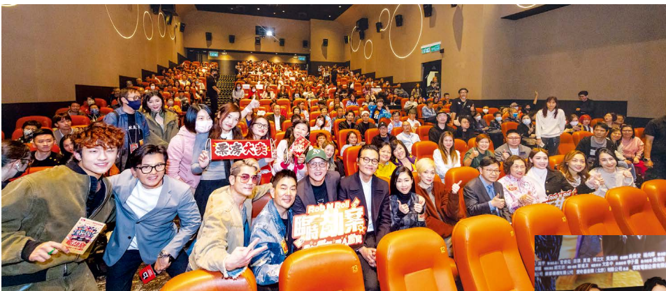
一眾嘉賓及演員到戲院謝票，感謝觀眾的愛戴和對仁濟慈善工作的支持 Guests and actors walked into the theaters to thank the audiences for their support for the movie and Yan Chai's charity work