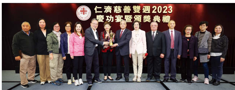
總殿軍：大窩口邨仁濟慈善籌備委員會 The 3 rd runner-up: Tai Wo Hau Estate Fundraising Committee