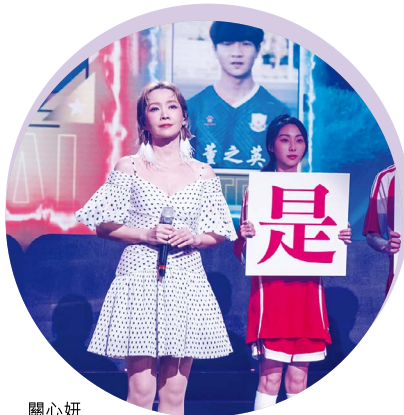
關心妍 Jade KWAN