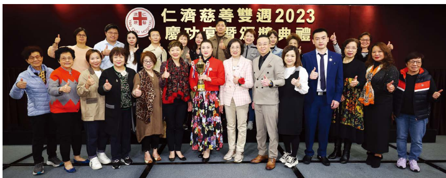
總亞軍：創樂和諧協會 1 st runner-up: Creative Harmony Association