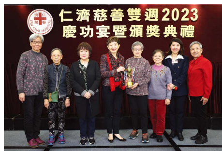
總第十名：群芳雅舍 The 9 th runner-up: Kwan Fong Club