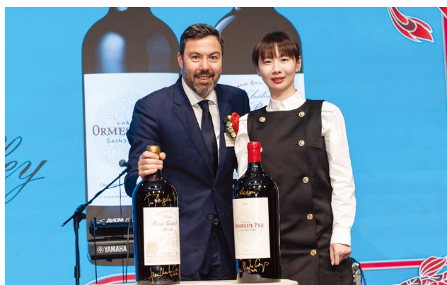
Château Ormes de Pez 2010 Imperial (6公升/6L) Château Haut-Batailley 2018 Imperial (6公升/6L) 捐贈者: Château Lynch-Bages Donor: Château Lynch-Bages 承投者: 戴鈞安夫人 Auction Winner: Mrs. Anson DAI