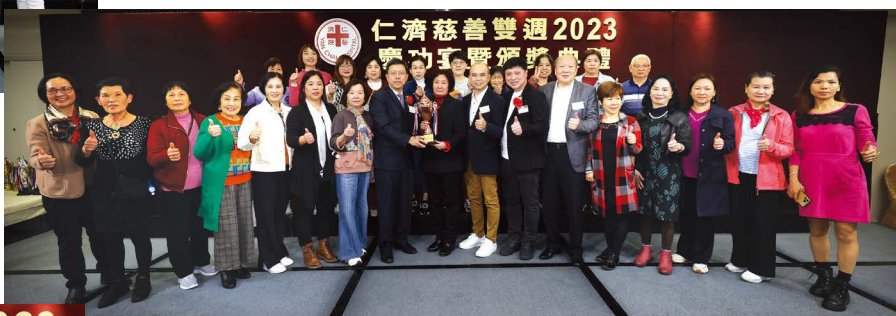
慈善獎券最高銷售季軍：將軍澳福建同鄉會 2 nd runner-up: Tseung Kwan O Fukieneese Association