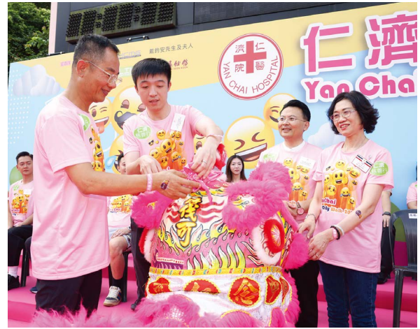
一眾嘉賓為醒獅點睛，為活動增添喜慶 Guests performed the eye dotting ceremony of lions and adding the rejoicing and festivity to the atmosphere