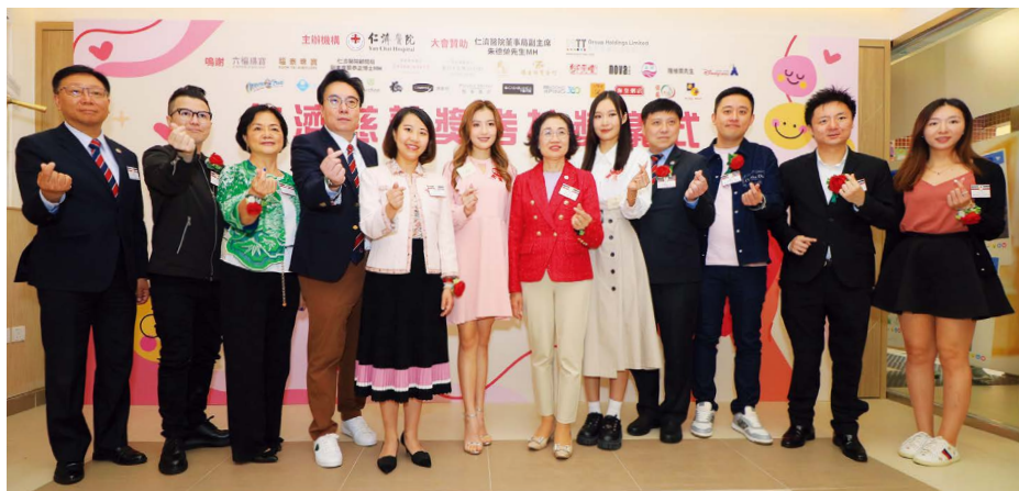
董事局成員與2023年香港小姐為善長獻上愛心，預祝他們好運 Board Members and Miss Hong Kong 2023 expressed their gratitude to donors for their support