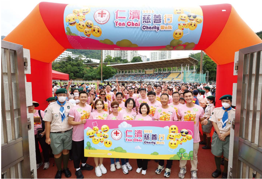
嘉賓們精神奕奕，齊出發 Let's go