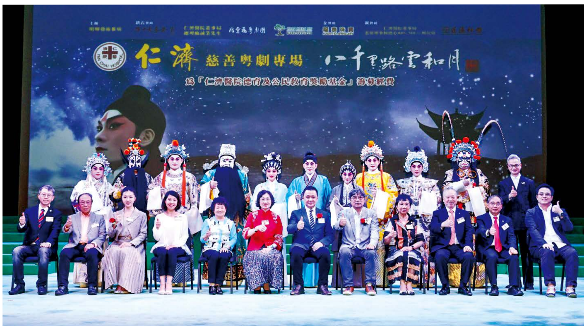
主禮嘉賓與一眾董事局成員、贊助人及表演嘉賓於台上大合照 Group photo of Guest of Honour, Board Members, performers and sponsors