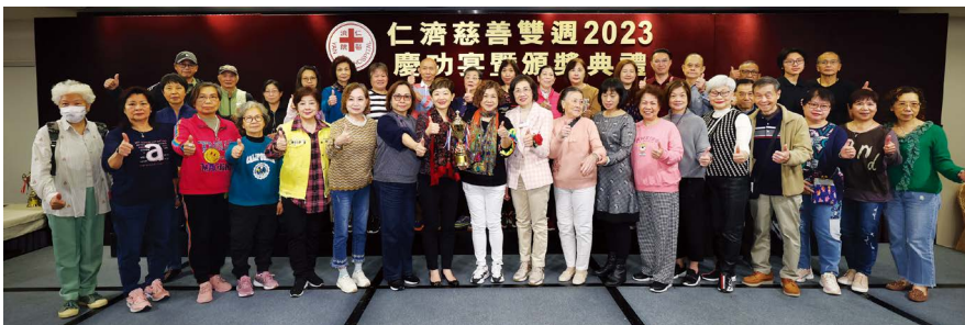
總季軍：大埔愛心籌委會 2 nd runner-up: Tai Po Love Organizing Committee