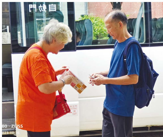
義工積極向市民勸銷獎券 The Volunteer was selling raffle ticket actively