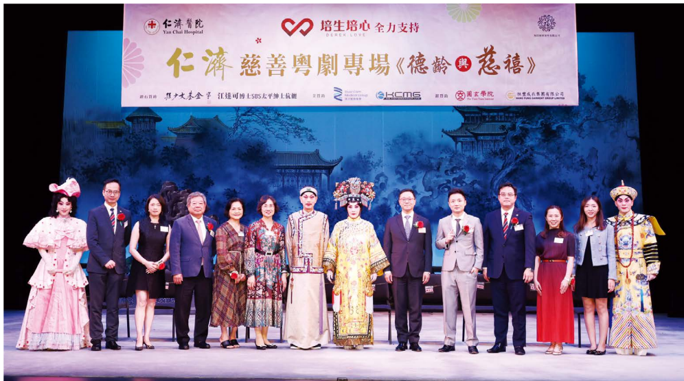
主禮嘉賓與羅家英博士、汪明荃博士及一眾董事局成員、嘉賓及演員於台上大合照 Guest of Honour, Dr. LAW Ka-ying and Dr. Liza WANG took photo with Board Members, guests and actors