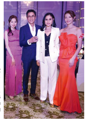
「仁濟慈善大使」馬德鐘與太太、2022年香港小姐冠軍林鈺洧小姐及友誼小姐邢慧敏小姐到場支持 Joe MA, "Yan Chai Charity Ambassador", along with his wife, Denice LAM, Miss Hong Kong Champion, and Sharon YING, Miss Friendship of Miss Hong Kong attended to support