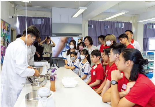
第二中學學生示範製作分子料理 Students from Yan Chai Hospital No.2 Secondary School demonstrated the creation of molecular cuisine