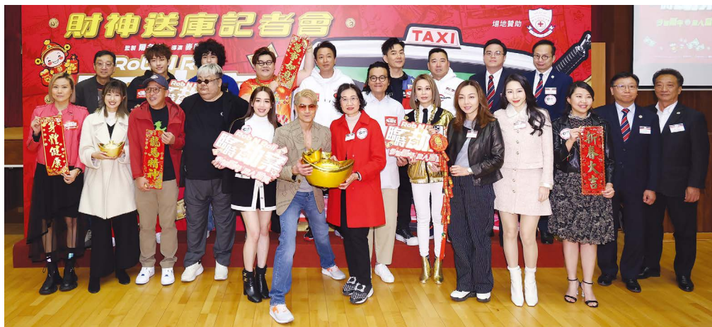
董事局成員向演員們送贈金元寶，預祝票房大捷 Board Members presented gold ingots to actors, wishing the box office success