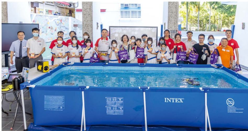
董事局成員、學生會成員送禮物答謝第二中學一眾師生 Board Members and the Transworld Committee presented gifts to the teachers and students of Yan Chai Hospital No.2 Secondary School