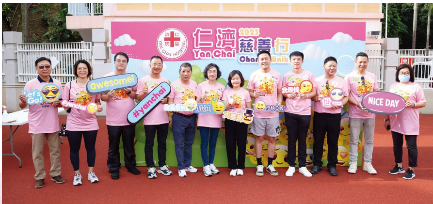
政府官員及地區首長均出席支持，與董事局成員一同步行做運動 Government officials and district leaders attended to support