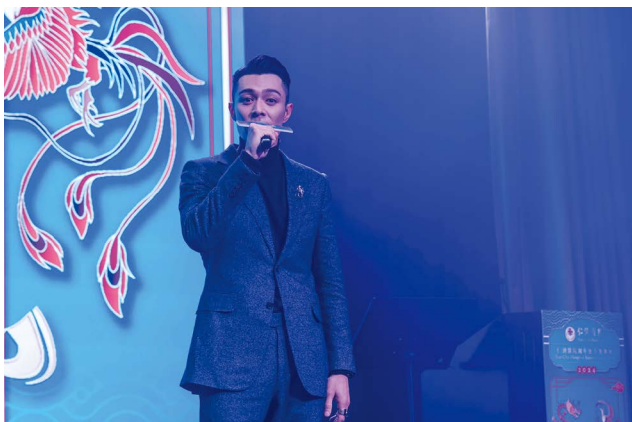
表演嘉賓周柏豪與鄭融合唱經典金曲，帶動全場氣氛 The incredible performance by singer Pakho CHAU and Stephanie CHENG