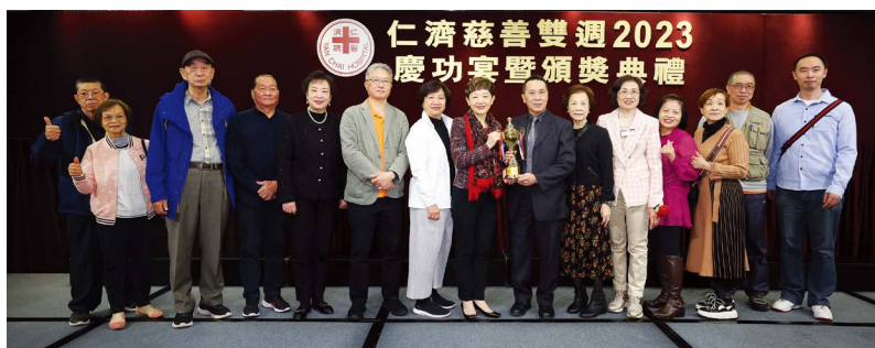
總第五名：荃灣街坊福利會有限公司 The 4 th runner-up: Tsuen Wan KaiFong Welfare Association Limited