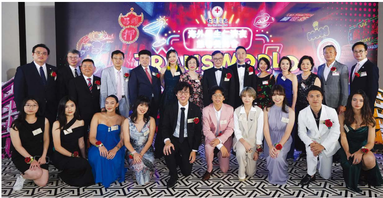
董事局成員、學生會成員與主禮嘉賓合照留念 A group photo of Board Members and Transworld Committees with the Guest of Honor