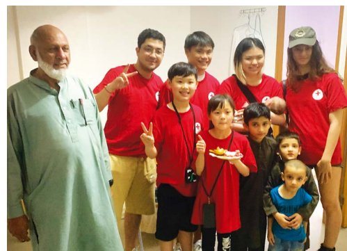
受助家庭親手泡製家鄉美食咖哩雞招待學生 The beneficiary family kindly treated their hometown cuisine, Curry Chicken to the Transworld Committee