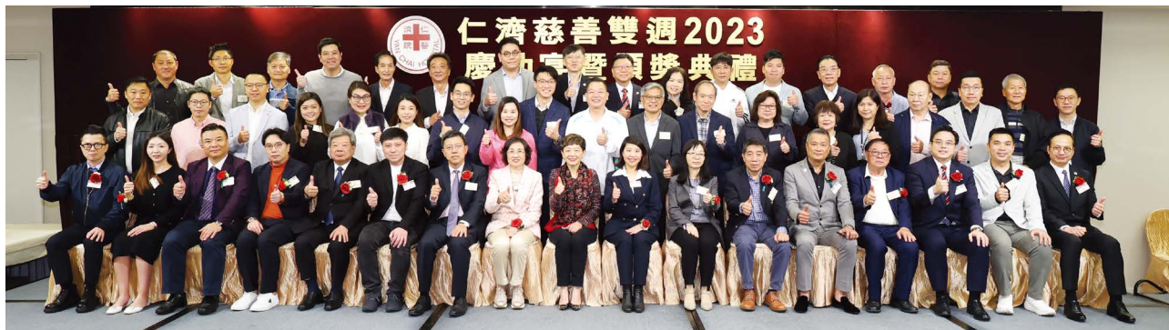
董事局成員及眾嘉賓與主禮嘉賓合照 Group photo of Board Members and guests with the Guest of Honour