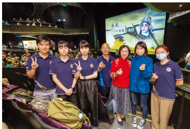
大會撥出部分座位予學生欣賞，讓傳統粵劇文化傳承予年輕一代 Seats were reserved for students to promote traditional Cantonese opera culture to the younger generation