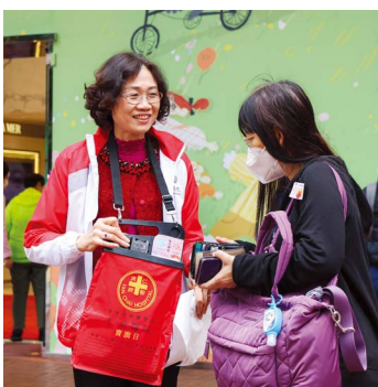
董事局成員亦落力向市民募捐 Board Members called for public support