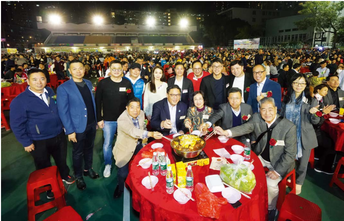
嘉賓們開懷地享用盆菜，感受熱鬧氣氛 All guests enjoyed the poon choi together