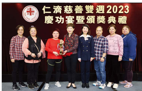
總第九名：街坊互助關懷協會及葵涌邨逸葵居民協會 The 8 th runner-up: Community Mutual Help and Care Association and Kwai Chung Estate Yat Kwai Residents Association