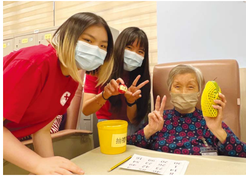
跟一眾老友記玩遊戲及送禮物，共度一個美好的下午 Playing games and presenting gifts to the elder, having a wonderful afternoon together