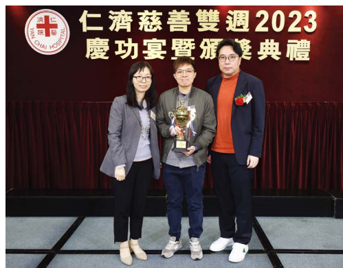
仁濟屬下單位慈善獎券最高銷售冠軍： 仁濟醫院方若愚長者鄰舍中心 The Champion of "The Most-funds-raised Unit of Yan Chai Raffle Sale" among Yan Chai Social Services Subsidiary units: Yan Chai Hospital Fong Yock Yee Neighbourhood Elderly Centre