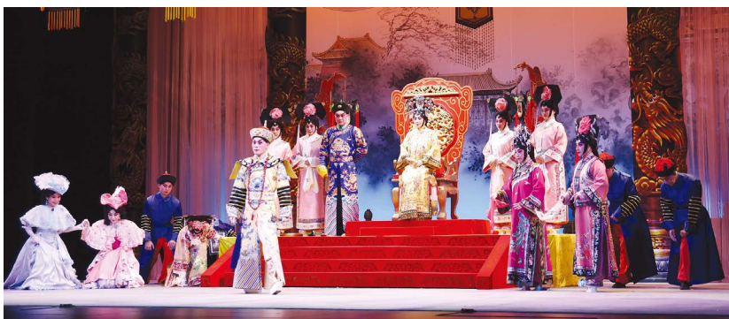
當晚劇目以生動有趣方式演繹，獲得觀眾如雷的掌聲 The repertoire was lively and captivating, attracting enthusiastic responses from the audience