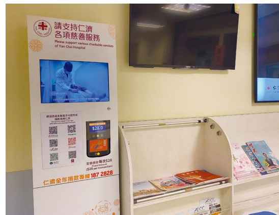
於蘇啟聲牙科診所增設八達通捐款機 New Octopus Machine installed at the So Kai Sing Dental Clinic

Yan Chai has also installed Octopus Donation Machines at the lobby of the Yan Chai Hospital Multi-Services Complex and So Kai Sing Dental Clinic located at 6th Floor, Block C, Yan Chai Hospital. The machines provide a convenient and efficient way for donors, while also saving administrative resources and time that would have been spent manually on counting coins. This initiative aims to enhance the effectiveness of fundraising efforts.