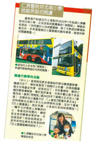
傳媒正面報道院屬學校特色 Positive media coverage of our schools' special features