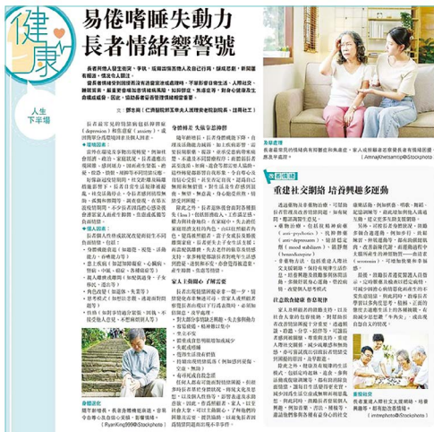
於《明報》增設健康專欄 A new column called "Yan Chai Health News" in Ming Pao newspaper