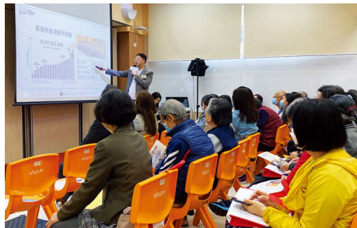
保協慈善基金嘉賓向出席者介紹保單捐贈的概念及意義 The guest speaker of LUA Foundation Limited introduced the insurance policies to the public