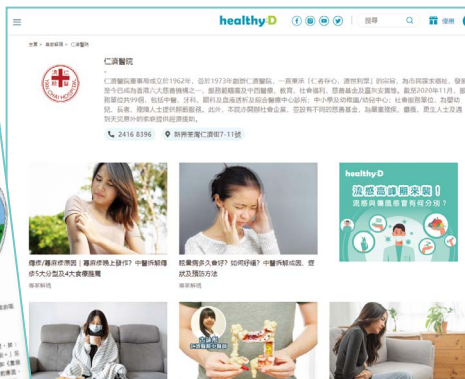
雜誌及網站的仁濟專欄 Yan Chai's columns in magazines and websites