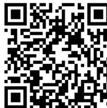
仁濟醫院最新機構宣傳片 Yan Chai Hospital Corporate Video