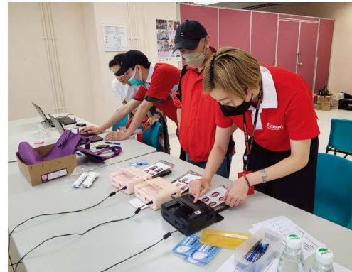
佳能香港贊助參與講座的人士證件相拍攝及打印服務 Canon Hongkong sponsored the photography and printing services for the attendees