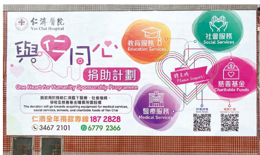
推出新的宣傳設計以吸引更多市民支持計劃 New promotional design has been launched to attract the public to support our programmes

計劃讓善長選擇捐贈指定醫療設施或教學儀器所需的費用予仁濟，令有需要人士及學生直接受惠，並在設施或儀器留下芳名以作紀念。