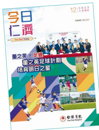
官方刊物《今日仁濟》 The official publication "Yan Chai Today"