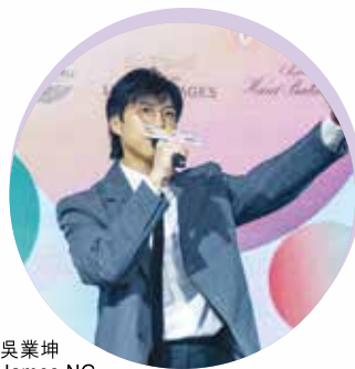
吳業坤 James NG

歌星獻唱，掀起全場氣氛 The incredible performances by singers lifted up the entire atmosphere