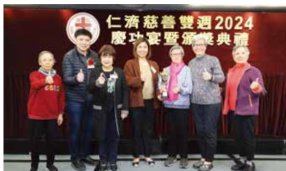
總第十名：群芳雅舍 The 9 th runner-up: Kwan Fong Club