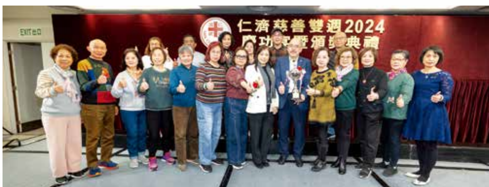
慈善獎券最高銷售亞軍：大埔愛心籌委會 1 st runner-up: Tai Po Love Organising Committee