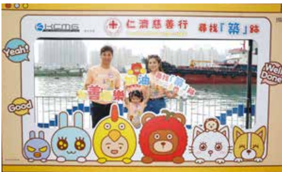
「荃心親子聯盟」陳展鵬、太太單文柔及女兒身體力行到荃灣支持慈善行，鼓勵更多家庭加入慈善行列，讓善心種子得以扎根 Ruco CHAN, Phoebe SIN and their daughter, appeared as Ambassadors of Charity Walk to encourage more families to support charity works, fostering the growth of kindness in our communities