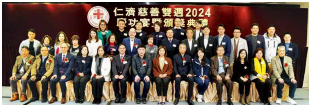
董事局成員及眾嘉賓與主禮嘉賓合照 Group photo of Board Members and guests together with the Guest of Honour