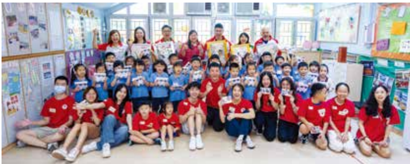
董事局成員及學生會成員探訪院屬九龍崇德社幼稚園/幼兒中心，小朋友們均十分開心 Board Members and the Transworld Committee visited Yan Chai Hospital Zonta Club of Kowloon Kindergarten/ Child Care Centre which made their day