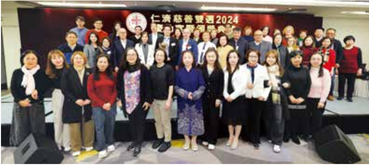
慈善獎券最高銷售季軍：將軍澳各界 2 nd runner-up: Tseung Kwan O Community