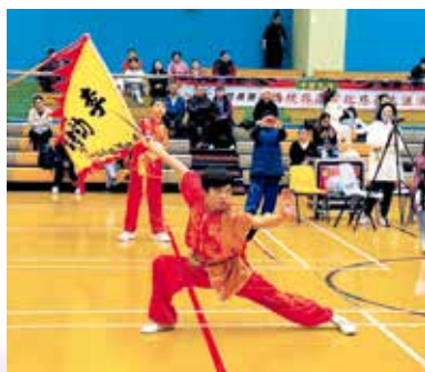
李飛樑國術體育會慈善武術大匯演 Martial Arts Performance by Li Fei Piu Chinese Martial Arts Association