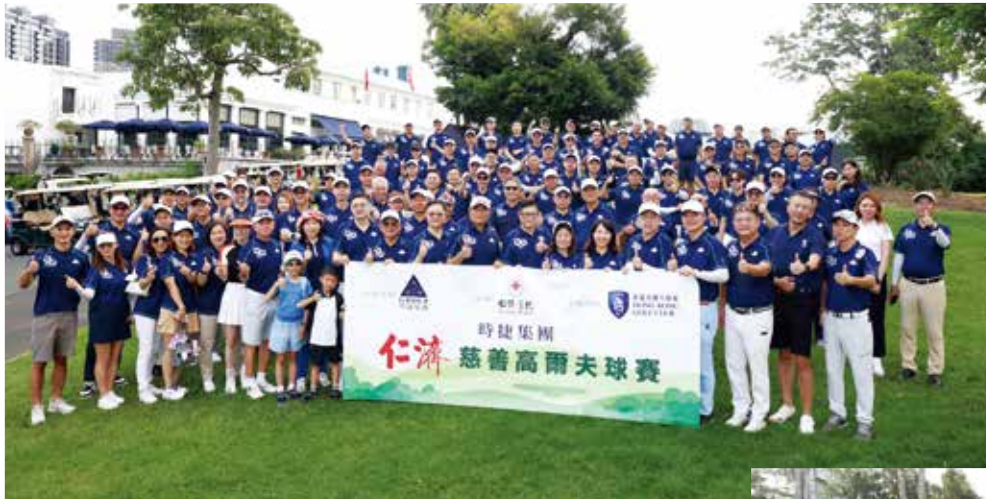
一眾高球好手於比賽前合照留念 Group photo of golfers before the tournament