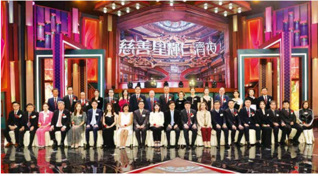
一眾董事局、顧問局成員、名譽理事與嘉賓合照 Group photo of Board and Advisory Board Members, Honorary Directors and guests