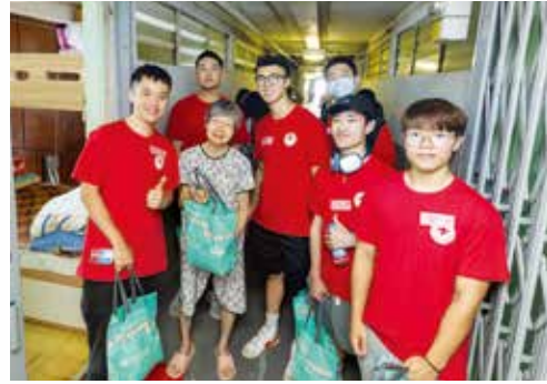
學生會成員一同前往華富邨向獨居長者送上愛心福袋，帶給他們溫暖及關懷 The Transworld Committee brought fortune bags to the elderly living alone in Wah Fu Estate, bringing warmth and care to them