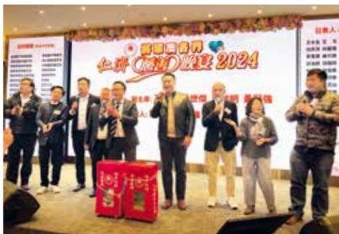
將軍澳各界籌款晚宴 Charity Dinner by Tseung Kwan O Community