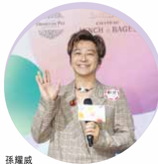
孫耀威 Eric SUEN