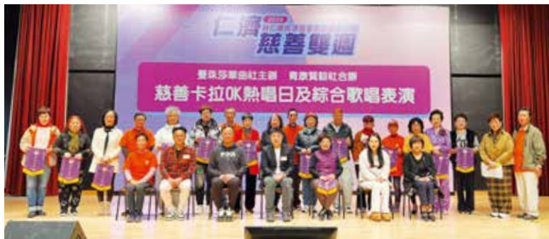
曼珠莎華曲社主辦、青康賢毅社合辦慈善卡拉OK熱唱日及綜合歌唱表演 Singing concert by Manjusri Flower Music Society and Ching Hong Yin Ngai Society