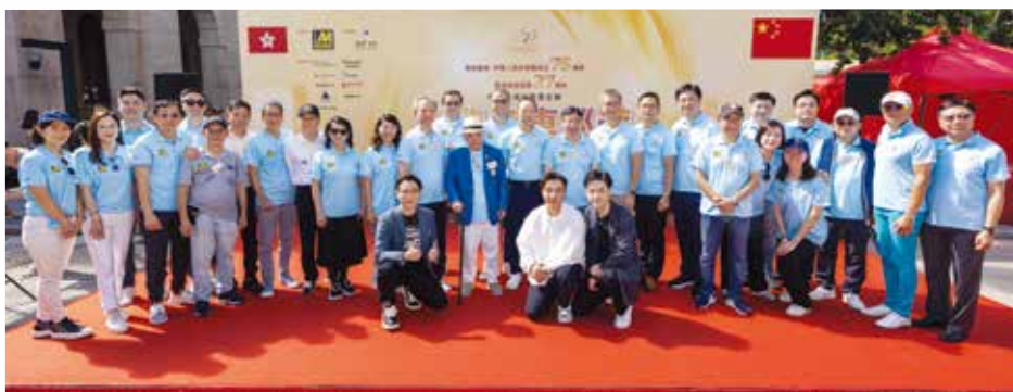
眾嘉賓齊聚中環遮打道，為經典名車巡遊主持啟動禮 Guests gathered to host the kick off ceremony of the Classic Car Parade at Chater Road in Central