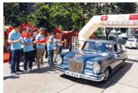
與國家領導人座駕同款的紅旗復刻版帶領75架經典名車，出發巡遊香港 A replica of the Hongqi vehicle used by national leaders led 75 classic cars, setting off on a parade through Hong Kong