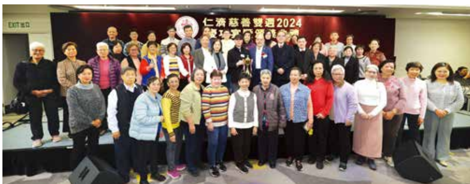
慈善獎券最高銷售冠軍：香港神慈秀明會 The Champion of the Top Sales of Yan Chai Charity Raffle Tickets: Shinji Shumeikai of Hong Kong Ltd.