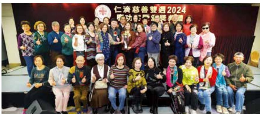
總亞軍：大埔愛心籌委會 1 st runner-up: Tai Po Love Organising Committee