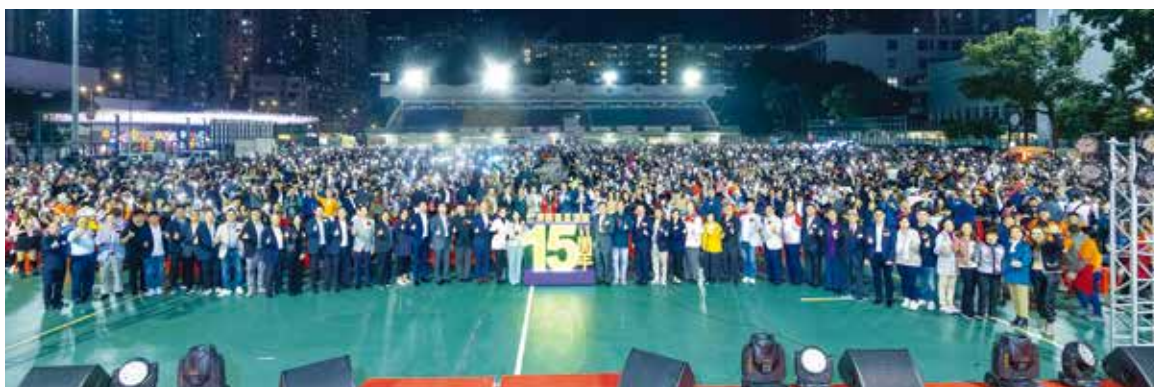
一眾嘉賓與現場6,550位來賓及善長大合照，同賀盆菜宴15周年 A group photo of all the distinguished guests and attendees, celebrating the 15 th anniversary of the Poon Choi Feast