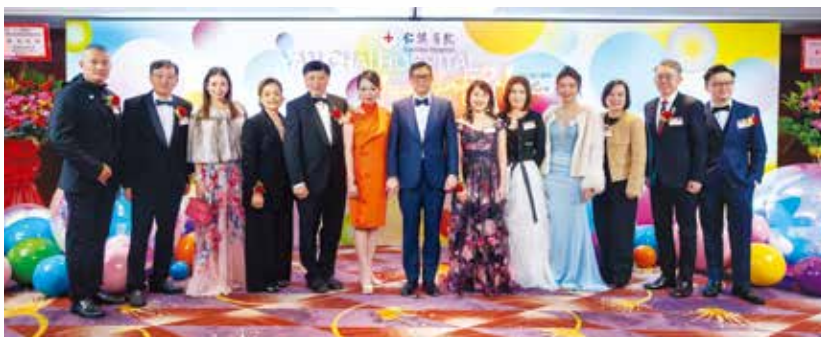
主禮嘉賓與一眾董事局成員合照留念 Group photo of the Guest of Honour and Board Members