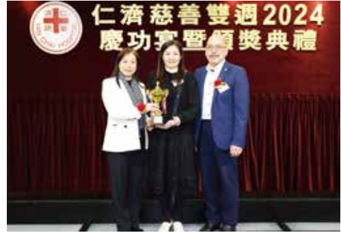
仁濟屬下學校慈善獎券最高銷售冠軍：仁濟醫院羅陳楚思小學 "The Champion of the Most-funds-raised Unit of Yan Chai Raffle Sale" among Yan Chai affiliated schools: Yan Chai Hospital Law Chan Chor Si Primary School