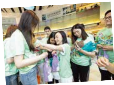
嘉賓們現場購買愛心曲奇 Guests showed their support and purchased charity cookies