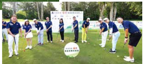
保安局局長鄧炳強GBS, PDSM太平紳士及主禮團預備揮杆開球 Group photo of Mr. TANG Ping-keung, GBS, PDSM, JP, Secretary for Security and officiating guests were ready to tee off