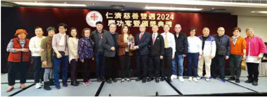
總殿軍：大窩口邨仁濟慈善籌備委員會 The 3 rd runner-up: Tai Wo Hau Estate Fundraising Committee