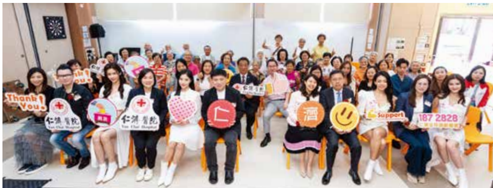
一眾嘉賓與長者中心會員見證攪珠抽獎 Guests and the members of the elderly centre witnessed the lottery draw ceremony