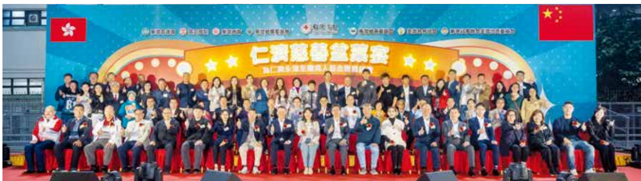
主禮嘉賓與董事局成員及一眾嘉賓出席支持 The Guest of Honour, Board Members and other guests showed up to support the event