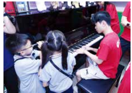
學生會成員以鋼琴現場演奏一曲，引來小朋友圍觀並細心聆聽 One of the Transworld Committee performed with the piano and drew the attentions of the students