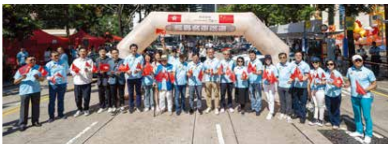
董事局成員齊齊出席支持活動，並與名車拍照留念 Board Members attended to support the event and took photo with the classic cars