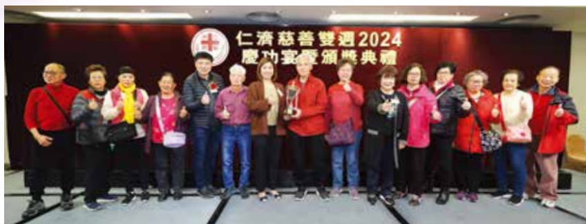
總第九名：長青和諧協會 The 8 th runner-up: Cheung Ching Harmony Association