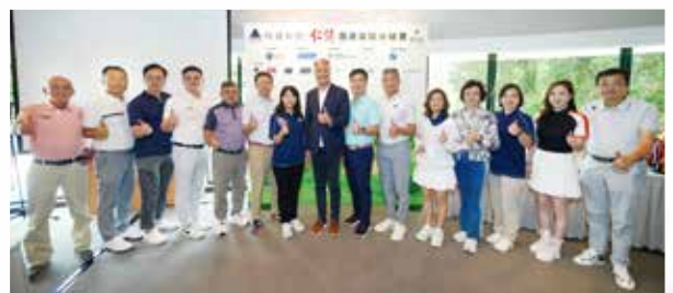
頒獎儀式於賽後舉行 Award ceremony was held after the tournament