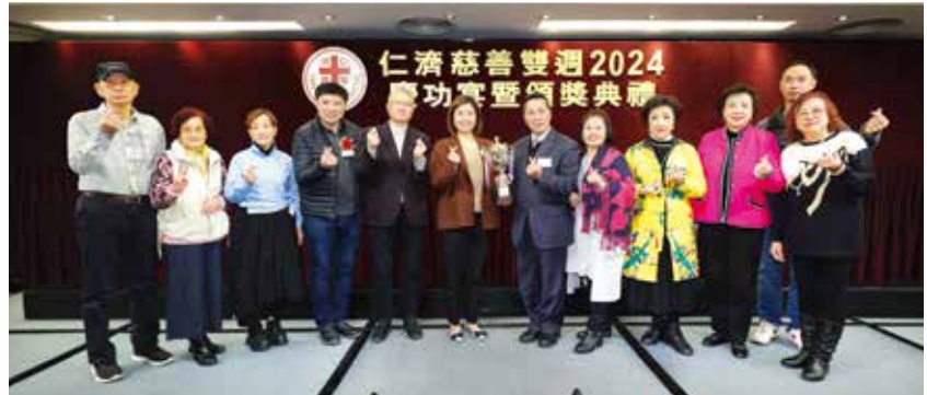
總第五名：荃灣街坊福利會有限公司 The 4 th runner-up: Tsuen Wan Kaifong Welfare Association Limited