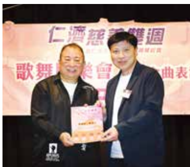
歌舞同樂會懷舊金曲表演 Singing Concert by Sing & Dance Association