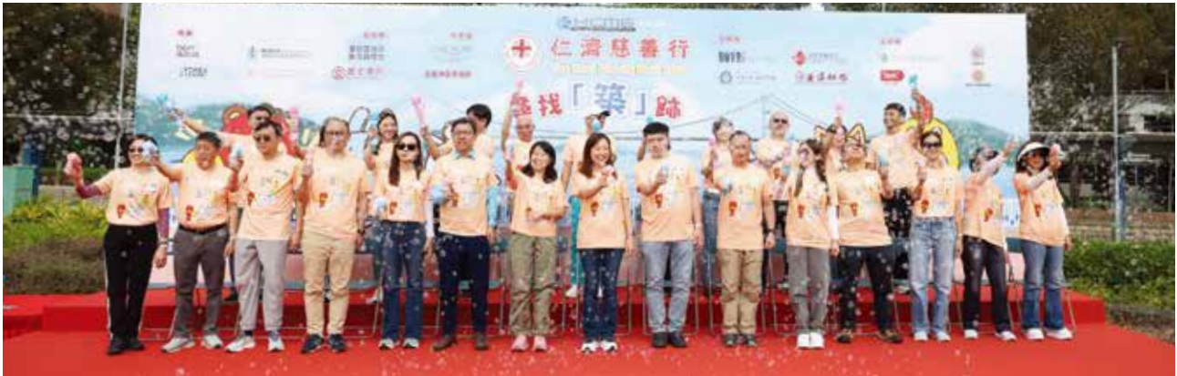
一眾董事局成員陪同主禮嘉賓高舉泡泡槍，為活動揭開序幕，漫天泡泡寓意仁濟醫院的慈善之心好比泡泡一樣，傳遍開去 The Guest of Honour accompanied by Board Members raised bubble guns joyfully, heralding the commencement of the event. Countless bubbles symbolised the charitable heart of Yan Chai Hospital, spreading far and wide