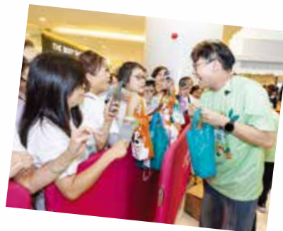
藝人落力向在場觀眾推銷曲奇 Artists made every endeavor to sell the charity cookies