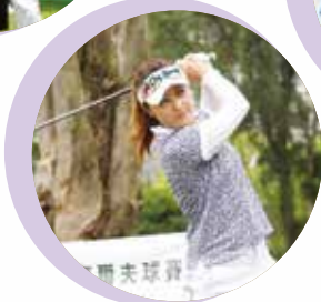
一眾藝人參與比賽支持活動 Artists participated in the competition to support the event