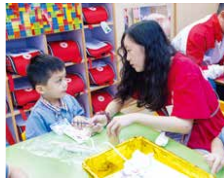
學生會成員與一眾小朋友玩遊戲，做手作 The Transworld Committee played traditional Chinese games and made handicrafts with the students