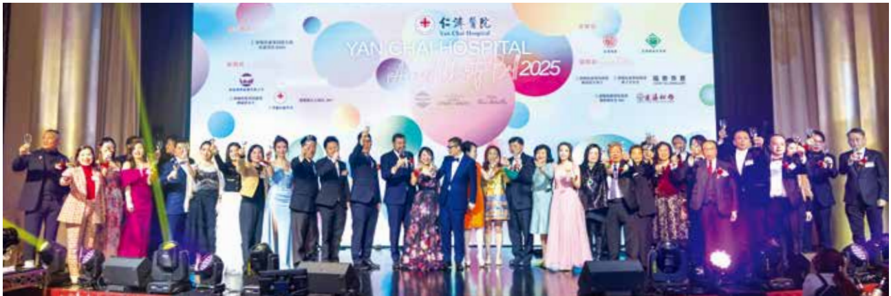
一眾董事局、顧問局成員、歷屆總理及嘉賓於台上祝酒，祝賀活動圓滿成功 Board Members, Advisory Board Members, former Directors and VIP guests made a toast on the stage for the success of the event