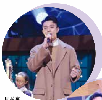
周柏豪 Pakho CHAU