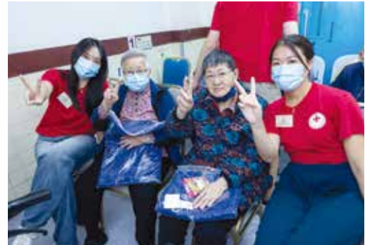
董事局成員與學生會成員一同前往仁濟醫院郭玉章夫人護理安老院，與長者們玩遊戲並送上禮物 Board Members and the Transworld Committee visited the elders at Yan Chai Hospital Mrs. Kwok Yuk Cheung Care & Attention Home and presented some gifts to them