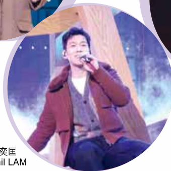
林奕匡 Phil LAM