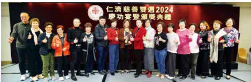
總季軍：創樂和諧協會 2 nd runner-up: Creative Harmony Association