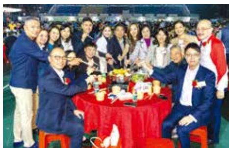
嘉賓們共享盆菜 Guests enjoyed the delightful Poon Choi feast together