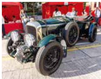
當日有多架名車參與巡遊，極具氣派 A number of classic cars participated in the parade