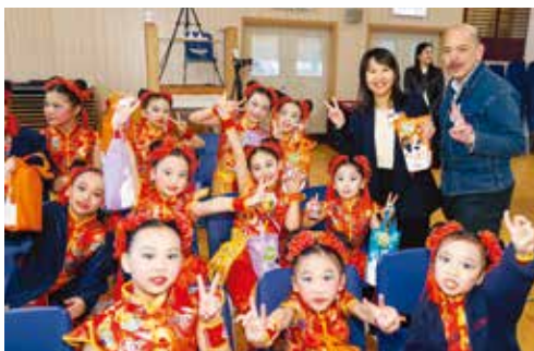
董事局成員陪同藝員嘉賓探訪院屬羅陳楚思小學，與小朋友大玩遊戲及送贈愛心曲奇 Board Members, guests and artists visited Yan Chai Hospital Law Chan Chor Si Primary School and presented charity cookies as gifts to the students