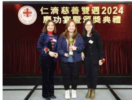
仁濟屬下單位慈善獎券最高銷售冠軍：仁濟醫院方若愚長者鄰舍中心 The Champion of "the Most-funds-raised Unit of Yan Chai Raffle Sale" among Yan Chai Social Services Subsidiary units: Yan Chai Hospital Fong Yock Yee Neighbourhood Elderly Centre