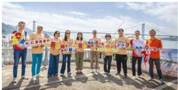
一眾董事局成員和嘉賓齊聚終點站機場核心計畫展覽中心，在春風送暖下一同欣賞美麗景色 Board Members and guests gathered at Airport Core Programme Exhibition Centre, enjoyed the beautiful scenery together under the warm spring breeze