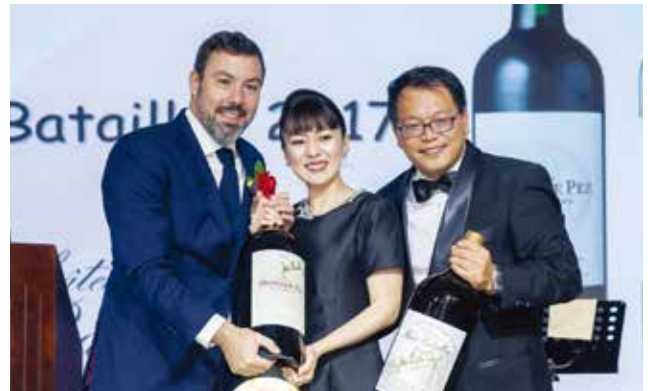
Chateau Ormes De Pez 2009, Imperial (6公升/6L) Château Haut Batailley 2017, Imperial (6公升/6L) 捐贈者 : Château Lynch-Bages Donor : Château Lynch-Bages 承投者 : 方志基先生 Auction Winner : Mr. Nigel FONG