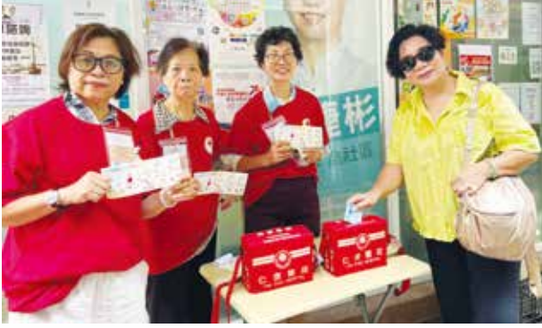
義工落力勸銷獎券 Volunteers sold raffle tickets diligently