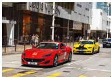
車隊出發巡遊港、九、新界，途經香港多個地標，為說好香港故事出一分力 The convoy set off on a parade through Hong Kong, Kowloon and New Territories, passing by various landmarks to contribute to telling the story of Hong Kong