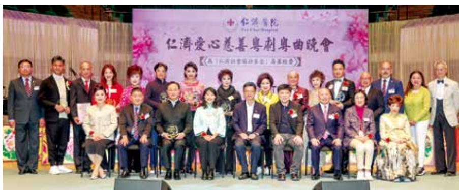
一眾表演嘉賓與主禮嘉賓及董事局成員合照 Board Members accompanied the Guest of Honour took a group photo with the performers