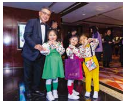
院屬裘錦秋幼稚園/幼兒中心小朋友向在場賓客勸銷獎券 Pupils of Yan Chai Hospital Tung Pak Ying Kindergarten/ Child Care Centre sold lottery tickets to the guests