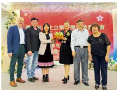
香港創毅和諧協會籌款晚宴 Charity Dinner by Creative Harmony Association