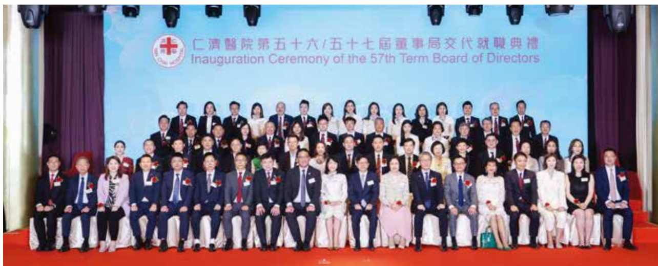
第五十六及五十七屆董事局全體總理、永遠顧問與嘉賓大合照 Group photo of the 56 th and 57 th Terms Board of Directors, Advisory Board Members and guests