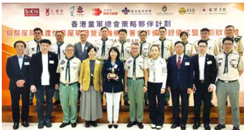
本院董事局成員及同工與香港童軍總會代表合照 Board Members and representatives of Scout Association of Hong Kong