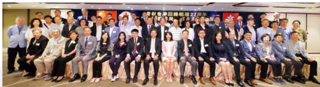
董事局成員與一眾荃灣地區團體代表合照 Group photo of Board Members and representatives from different Tsuen Wan District organisations