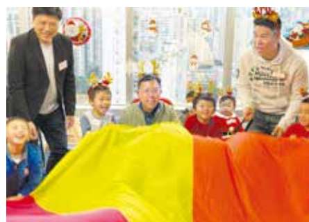
嘉賓與小朋友一同玩遊戲，令現場充滿節日的開心氣氛 Guests played games with the children and created a joyful and festive atmosphere at the venue