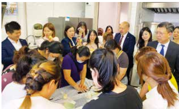
服務使用者在賽馬會「仁濟耆」的社區廚房內製作包點 Service users of Jockey Club Yan Chai Community Hub made buns at the community kitchen