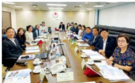
董事局高級職員向董事局成員介紹仁濟服務 Senior staff members of the Board introduced the services of Yan Chai to the Board Members