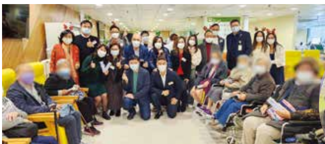
董事局成員、顧問局成員及名譽理事們向住院病人送上溫暖的問候 Board Members, Advisory Board Members and Honorary Directors extended their warmest regards to patients