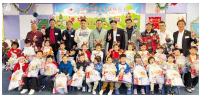
董事局成員及荃灣商會代表向幼童送上聖誕禮物 Board Members and the representatives of Tsuen Wan Trade Association presented Christmas gifts to children