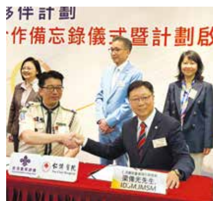
本院與香港童軍總會簽署合作備忘錄 Yan Chai signed the Memorandum of Partnership with the Scout Association of Hong Kong