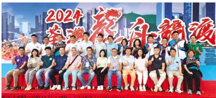
一眾主辦及協辦單位代表與主禮嘉賓大合照 Group photo of representatives from the organising and co-organising units with the Guest of Honour