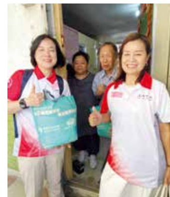
董事局成員與新界社團聯會北區地區委員會、龍山分區委員會，以及鳳水分區委員會合作，上門探訪及送贈福袋予彩園邨的老友記 Board Members and the North District Committee of the New Territories Association of Societies, Lung Shan Area Committee (North), Fung Shui Area Committee (North) visited the elders at Choi Yuen Estate