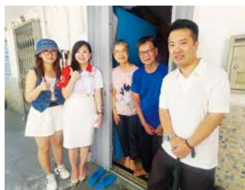
董事局成員與嘉賓們親身上門向華富邨長者送贈愛心福袋 Board Members and guests delivered the fortune bags to the elders in Wah Fu Estate