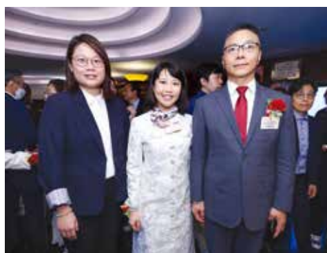
政府官員及顧問局成員紛紛到賀，見證新一屆董事局成立 Government officials and Advisory Board Members celebrated and witnessed the inauguration of the new term Board of Directors