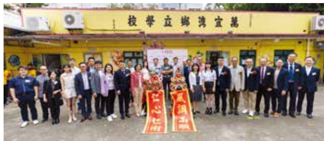
一眾嘉賓在舞麒麟表演後大合照 Group photo of the guests after the Hakka unicorn dance performance