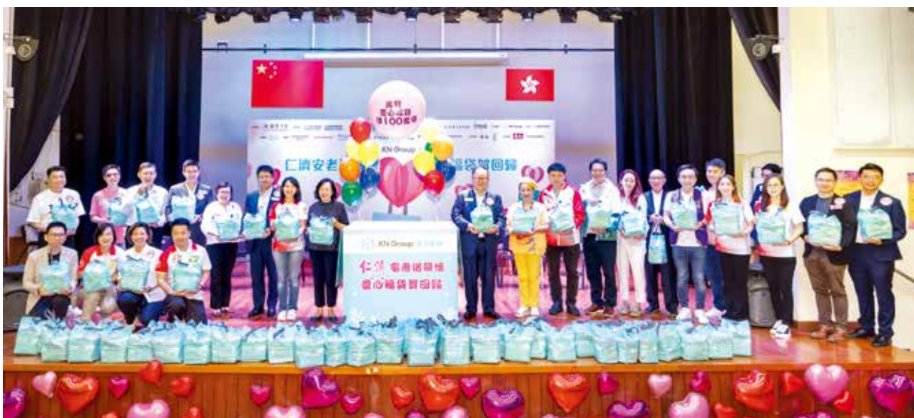
董事局成員及嘉賓們濟濟一堂參與愛心福袋活動揭幕禮 Board Members and guests joined the fortune bag Kick-off Ceremony