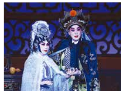
劇團的精彩表演吸引了在場觀眾的目光 The brilliant performance of the theater troupe captivated the audience in attendance