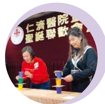
董事局成員與同事們一起參加遊戲 Board Members had great fun in the party with colleagues