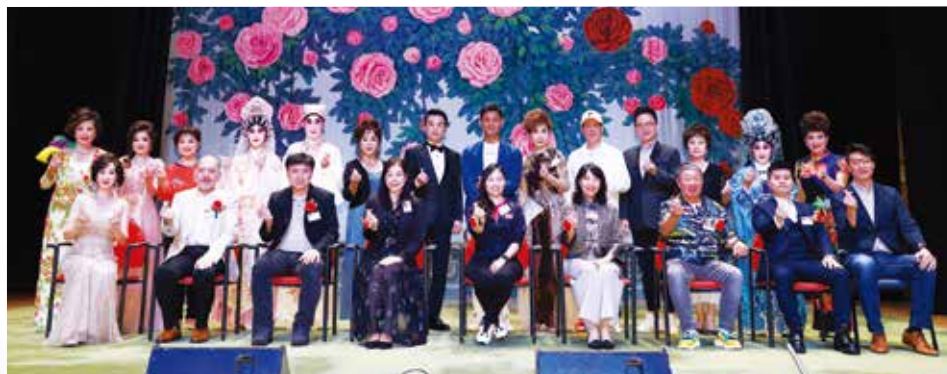
主禮嘉賓與一眾董事局成員及演出者於台上大合照 Group photo of Guests of Honour, Board Members and performers