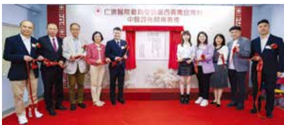
一眾嘉賓主持揭幕儀式 All guests hosted the unveiling ceremony