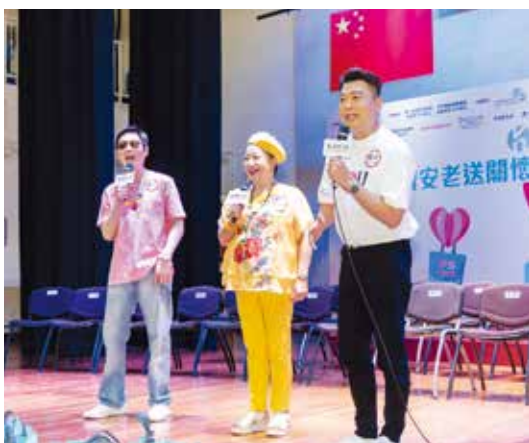
仁濟慈善大使薛家燕、仁濟關愛之星李思捷、阮兆祥與一眾老友記分享防詐騙貼士 Yan Chai Charity Ambassador Ms. Nancy SIT, Yan Chai Caring Star Mr. Johnson LEE and Mr. Louis YUEN shared fraud prevention tips with elders