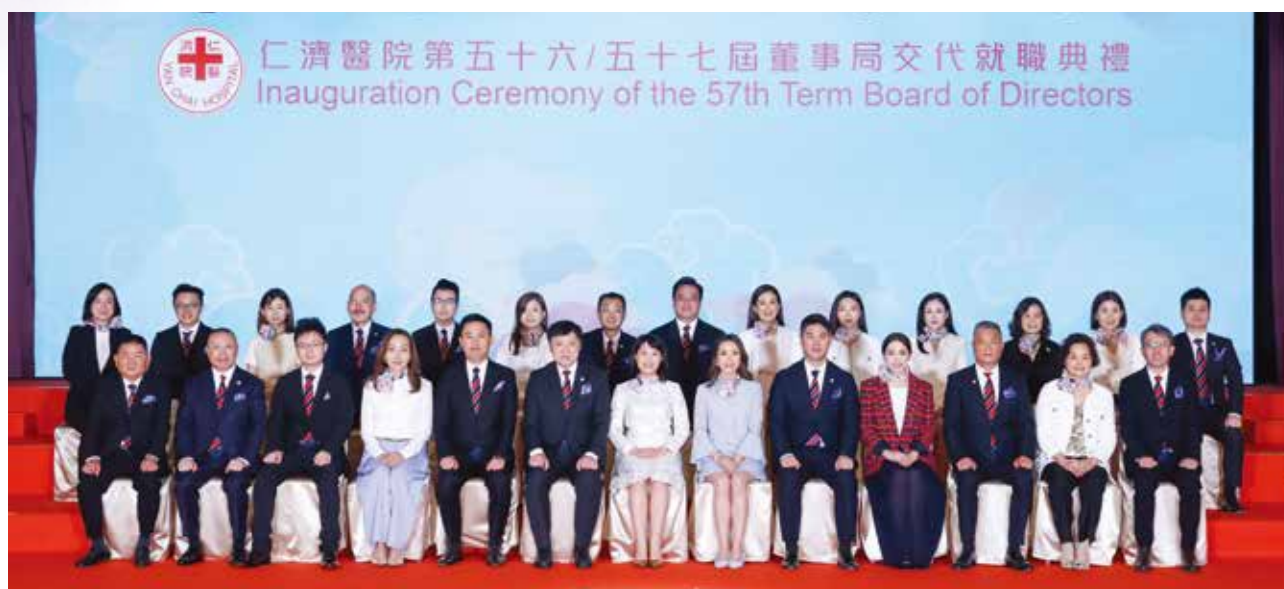
第五十七屆董事局全體總理大合照 Group photo of the 57 th Term Board of Directors