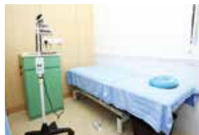
新診所佔地約600平方呎，設有2間診室和2間針灸房，候診區也比以前更加舒適 The new 600 sq. ft. clinic includes two consulting rooms and two acupuncture rooms, and the waiting area is more comfortable than before