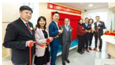
一眾嘉賓主持揭幕儀式 All guests hosted the unveiling ceremony

嘉賓參觀優化後的牙科診所設施 The guests visited the dental clinic