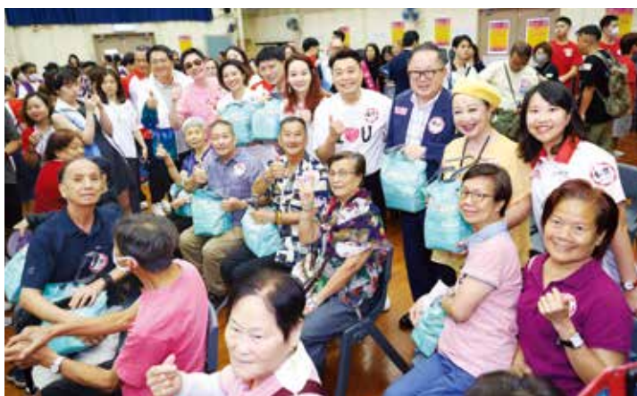
一眾董事局成員、藝人與嘉賓向現場老友記送贈福袋 Board Members, artistes and guests delivered the fortune bags to the elders