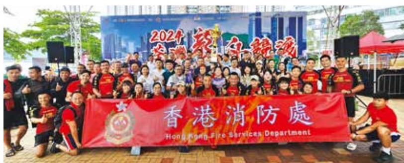
董事局成員頒發金盃予奪魁隊伍「香港消防處體育福利會」 Board Members presented a trophy to HK Fire Services Sports & Welfare Club, the champion of the race