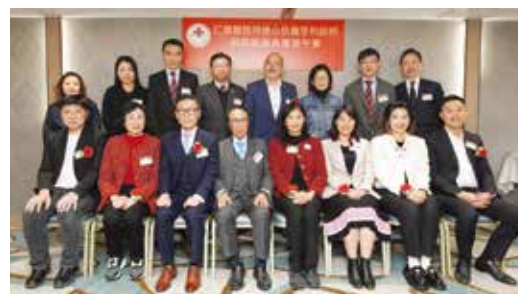
主禮嘉賓、善長聯同董事局成員及嘉賓大合照 Group photo of the Guest of Honour, donors, Board Members and guests