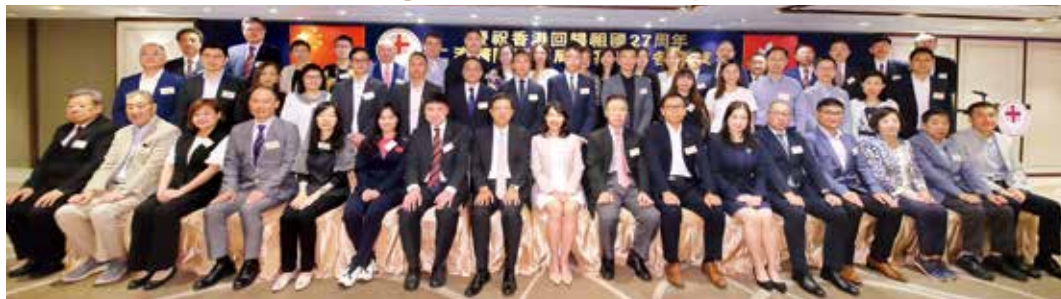
董事局成員與荃灣地區政府部門代表合照 Group photo of Board Members and the representatives from different government parties of Tsuen Wan District