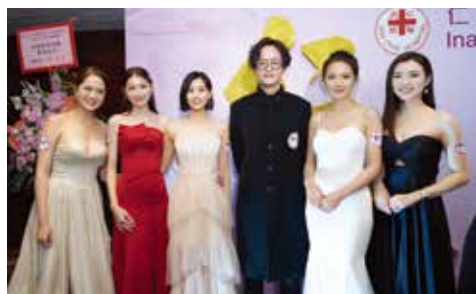
各界好友齊賀新一屆董事局成員就職之喜 Guests celebrated the inauguration of the new term Board of Directors