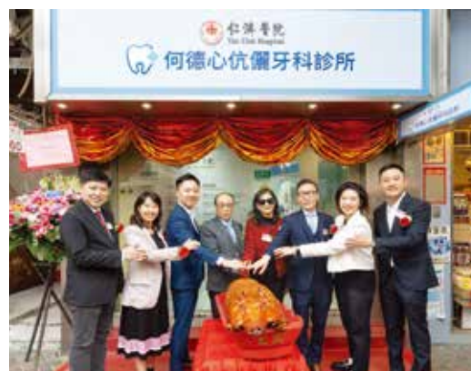
主禮嘉賓、善長聯同董事局成員主持切金豬儀式 The Guests of Honour, donors and Board Members hosted the roasted-pig cutting ceremony