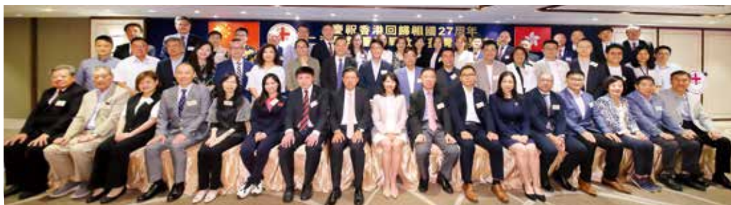
董事局成員與荃灣區「三會」主席及區議員合照 Group photo of Board Members, the chairmen from "the three committees" of Tsuen Wan District and Tsuen Wan District Council Members