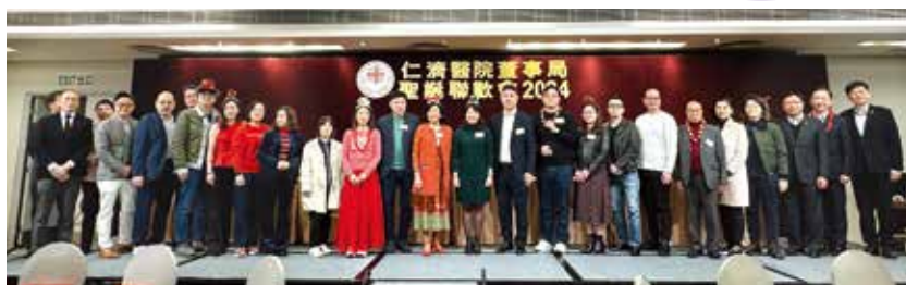
董事局成員、顧問局成員及名譽理事們出席員工聖誕聯歡會，與同事們共慶佳節 Board Members, Advisory Board Members and Honorary Directors attended the Christmas party to celebrate the festive season with colleagues