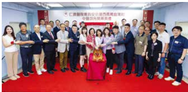
主禮嘉賓聯同善長、董事局、顧問局成員以及各界嘉賓主持切金豬儀式 The Guests of Honour, donors, Board Members, Advisory Board Members and guests hosted the roasted-pig cutting ceremony