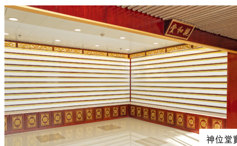
神位堂實景 Ancestral table

Looking ahead, the Filial Park is now actively working with the Food and Environmental Hygiene Department and other government departments to apply for additional niches. 2023 marks the 10 th anniversary of the columbarium service of Filial Park and it is hoped that more niches will be launched in the near future to serve the public.