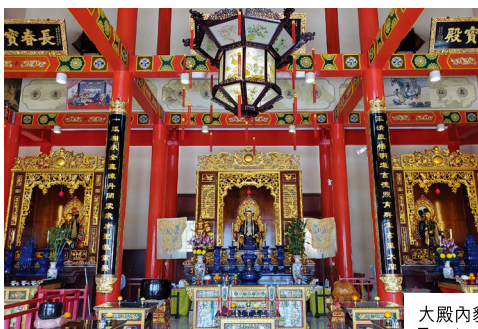
大殿內貌 Tao temple