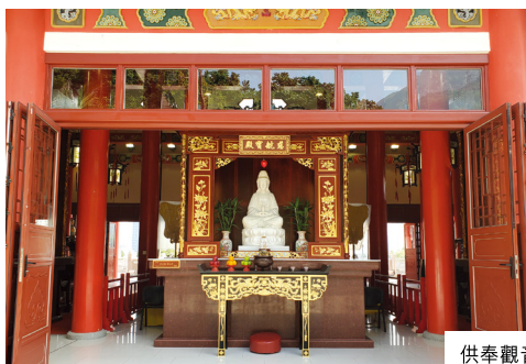
供奉觀音 Guanyin Worship