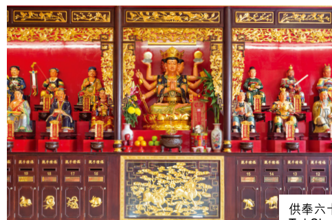
供奉六十太歲 Tai Shui Worship