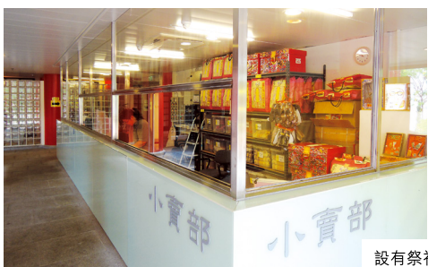
設有祭祀用品售賣 Oblation selling

We provide sacrificial rites arrangement to the public, and launches Tai Shui worship in the temple area, providing Lucky Lantern and related religious activities to worshippers who pray for luck. By the end of July 2014, "Filial Park" Development Project has brought about significant financial contributions to Yan Chai. All the surplus after deducting cost would be devoted to develop and support our other charitable services.