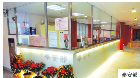
奉安部 The Etiquette Department