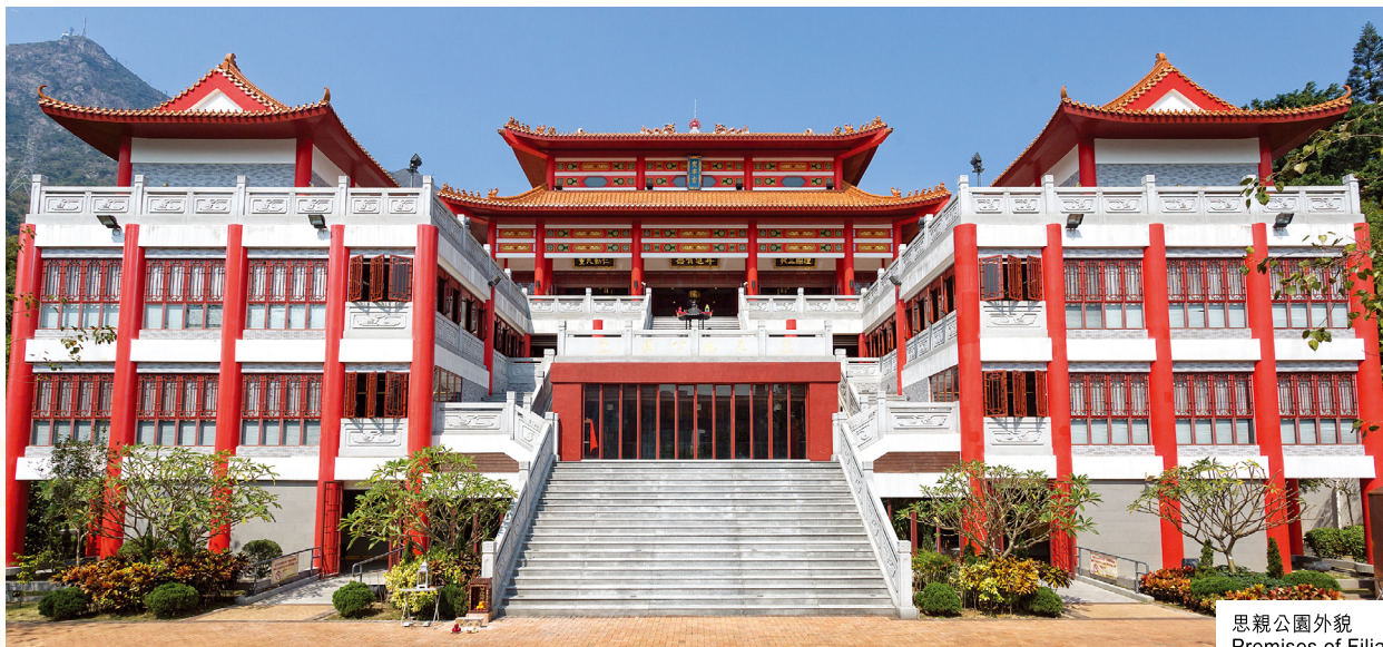
思親公園外貌 Premises of Filial Park

The Filial Park has complied with land leases and the statutory town planning requirements. The niches are all family niches for accommodating a maximum of 2 cremated ashes urns. Every detail of the Filial Park has been taken into serious consideration regarding the design, operation and management. The total construction cost of the Filial Park has reached $160 million. At the end of December 2020, a total of around 3,600 niches have been available for public application, and we launched ancestral table leasing service in the memorial hall in March 2017.