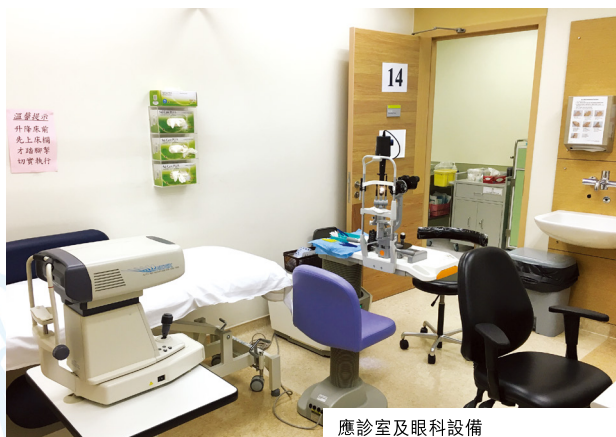
應診室及眼科設備 Consultation room and Equipment

With generous donation of around $1.7 million from BOCHK Charitable Foundation, the Board once again join hand with Hong Kong Association of Private Eye Surgeons Limited launching the “Yan Chai Hospital – BOCHK – Hong Kong Association of Private Eye Surgeons Limited: Outreach Cataract Charitable Pilot Programme” in 2019. The programme targets to provide free outreach eyecare consultations to elderly residing at elderly homes and other units of the Board’s Social Services Department and refer up to 110 eligible patients from residents of elderly homes and elderly patients of ophthalmology clinic to receive subsidized cataract surgery.