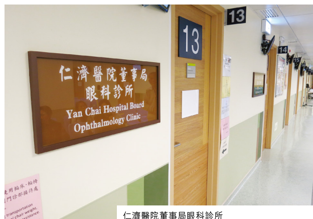
仁濟醫院董事局眼科診所 Yan Chai Hospital Board Ophthalmology Clinic