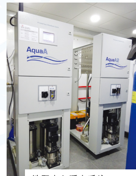
洗腎中心淨水系統 Water purification system of Renal Dialysis Centre