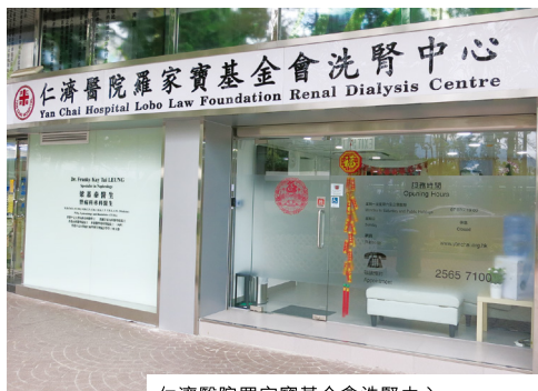
仁濟醫院羅家寶基金會洗腎中心 Yan Chai Hospital Lobo Law Foundation Renal Dialysis Centre

Furthermore, the Hospital Authority has recently awarded a 3 years service contract to our centre for extending the participation of "Haemodialysis Public-Private Partnership Programme" since April 2023, in order to cater the ever-growing demand of haemodialysis service in Hong Kong.