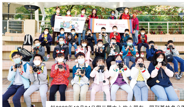
於2022年12月24日與三間中心的小朋友一同到荔枝角公園進行聖誕版本的「影像創趣」 The Christmas version of "Imaging For Fun" workshop was held on 24 December 2022 at Lai Chai Kok Park

Canon Hong Kong Corporate Volunteer Team organised the "Imaging for FUN" activity for children members from Yan Chai Hospital Wong Chu Wing Sze Youth Development Centre, 24th Term Board of Directors Social Services Centre – Lau Kwan Ming Children & Youth Centre and Yim Tsui Yuk Shan Fuk Loi Integrated Community Development Centre respectively. 60 children enjoyed the activity with learning techniques on using digital camera and photo-printing.