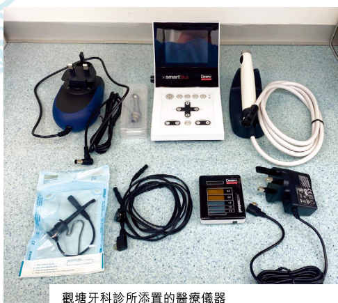
觀塘牙科診所添置的醫療儀器 Locator and rotatory handpiece instruments purchased by Kwun Tong Dental Clinic

計劃讓善長選擇捐贈指定醫療設施或教學儀器所需的費用予仁濟，令有需要人士及學生直接受惠，並在設施或儀器留下芳名以作紀念。本屆分別獲多位善長合共捐款10萬元予仁濟醫院董事局屬下診所添置醫療儀器，以及五萬元予社會服務部添置空氣淨化機。