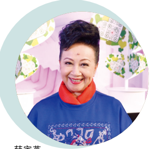
薛家燕 Nancy SIT