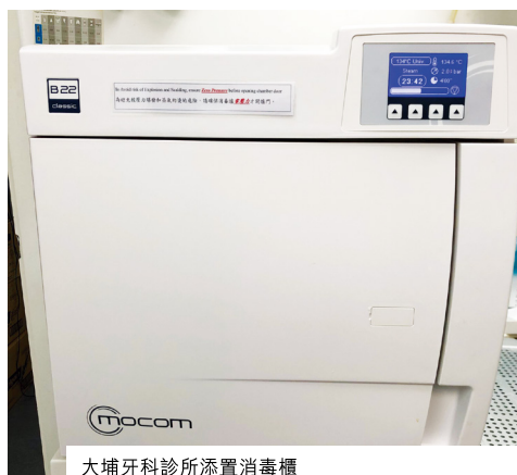
大埔牙科診所添置消毒櫃 Sterilising oven purchased by Tai Po Dental Clinic