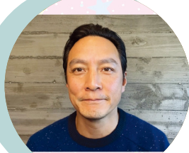
吳彥祖 Daniel WU