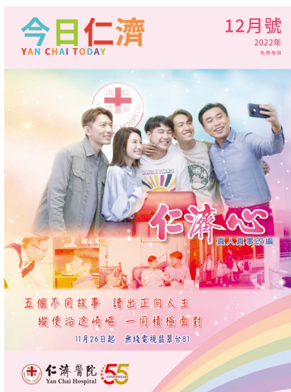
官方刊物《今日仁濟》 The official publication "Yan Chai Today"

The department publishes the official publication "Yan Chai Today", and manages the content on the official website and social media platforms, so that it can keep the public closely updated on Yan Chai's diversified services and development. The department also assists the professional team to promote medical, educational and social services of Yan Chai via local newspapers, magazines and online media.