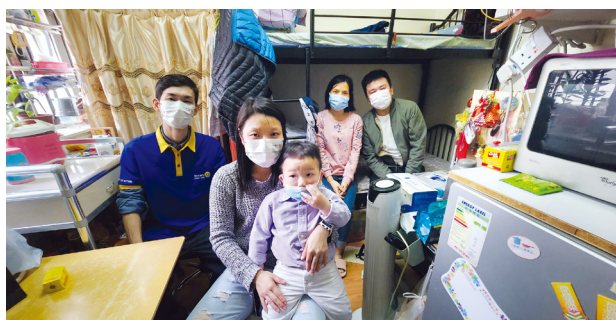
家長義工隊探訪荃灣區劏房戶 The volunteers visited the residents living in the subdivided flats in Tsuen Wan