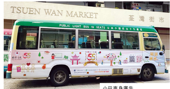
小巴車身廣告 Minibus body advertisement