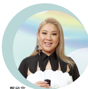
鄭欣宜 Joyce CHENG