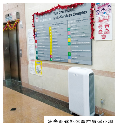
社會服務部添置空氣淨化機 Air purifier purchased by Social Services Department