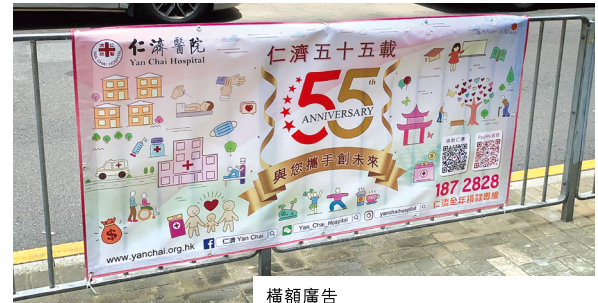
橫額廣告 Banner advertisement in the community