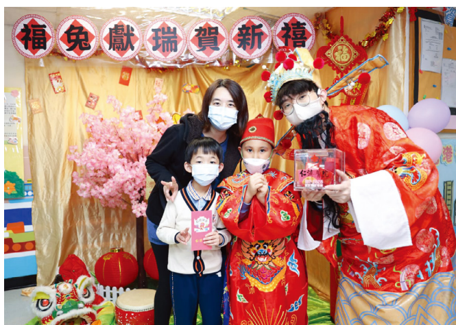
長者及學生十分踴躍支持捐利是活動 Students and elderly strongly supported the donation of red packets

Yan Chai teamed up with emoji® - The Iconic Brand to promote the message of love and care, and invited people in the community to participate in the "Spread Your Love Lunar New Year Campaign". Parents can take this opportunity to educate their children about the joy of sharing by donating the money from their red packets. All donations will be used to support Yan Chai Various Services Fund.