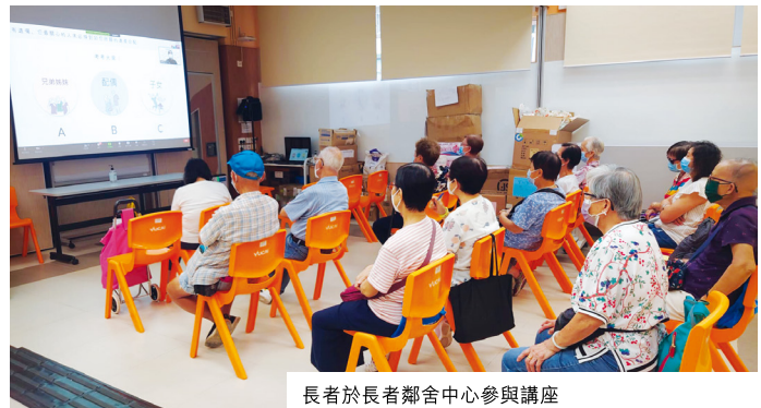
長者於長者鄰舍中心參與講座 Elderly participated in the online seminar at the Elderly Neighbourhood Centre