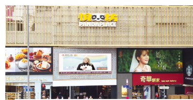
荃灣悅來坊商場免費協助播放仁濟宣傳片 Free advertising space granted by Panda Place Tsuen Wan