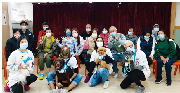
家長與小朋友參與動物醫生義工活動 Parent and child participated in the Doctor Pet volunteer activity