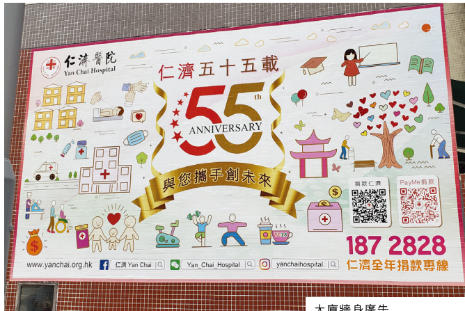
大廈牆身廣告 Wall sticker advertisement