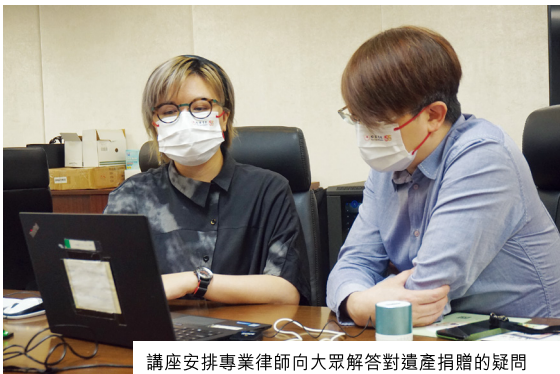
講座安排專業律師向大眾解答對遺產捐贈的疑問 Professional lawyers answered questions during the online seminar

To benefit the community and rekindle lives of other people, Yan Chai focuses on promoting the great benefits of legacy donation to the society. Regardless of the amount of the donation, Yan Chai greatly appreciates the goodwill of donors to pass on love to the next generation, and this is very precious to both Yan Chai and the people in need. In October 2022, YCH held an online seminar on the legacy giving, which encouraged the public to donate the legacy gift and carry on hopes for the community. This year, a total of 18 wills were received to donate the legacies to Yan Chai Hospital, and the bequests amounting exceeded $32,000,000.