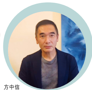
方中信 Alex FONG