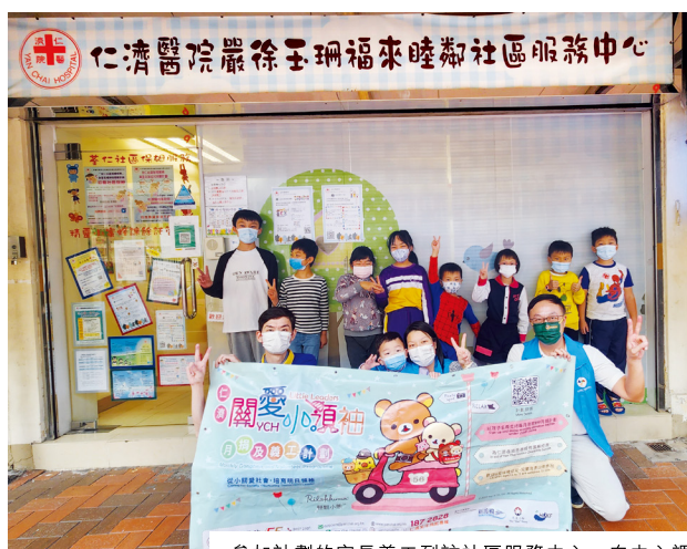
參加計劃的家長義工到訪社區服務中心，向中心課託生派禮物及合照 The volunteers took photo with students in the after-school tutorial class and gave them gifts