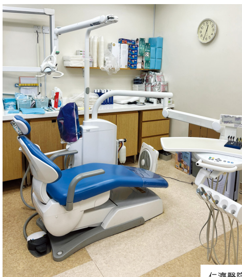
仁濟醫院蘇啟聲牙科診所診症室 Consultation room at Yan Chai Hospital Board So Kai Sing Dental Clinic

To promote oral health to seniors, we have been offering them charity price on dental services which include a $10 premium service for oral cavity examination since 2005. Being a charitable organization, we allocate all the proceeds derived from our dental services to finance other charitable services to express our thankfulness to the public for their continual support to Yan Chai Hospital.