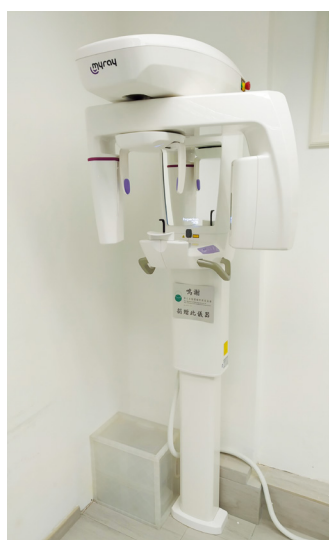
數碼全景掃描系統 — 仁濟醫院牙科診所（土瓜灣） OPG system at Yan Chai Hospital Dental Clinic (To Kwa Wan)